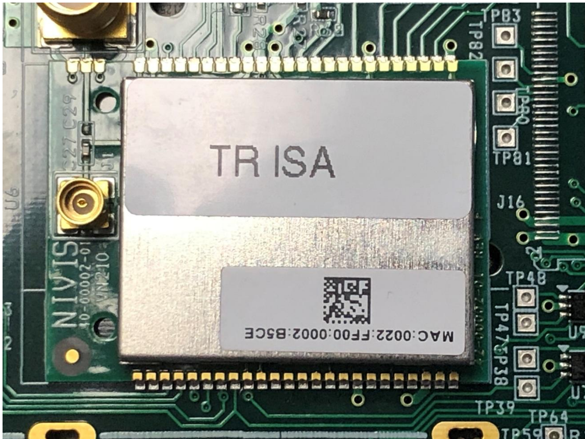
Figure 3. Module Radio 2 Co-Location

FCC Part 15 Class II Permissive Change 2AKZ5-CDSVN210ISA 18-0412 February 5, 2019 Control Data Systems VN210