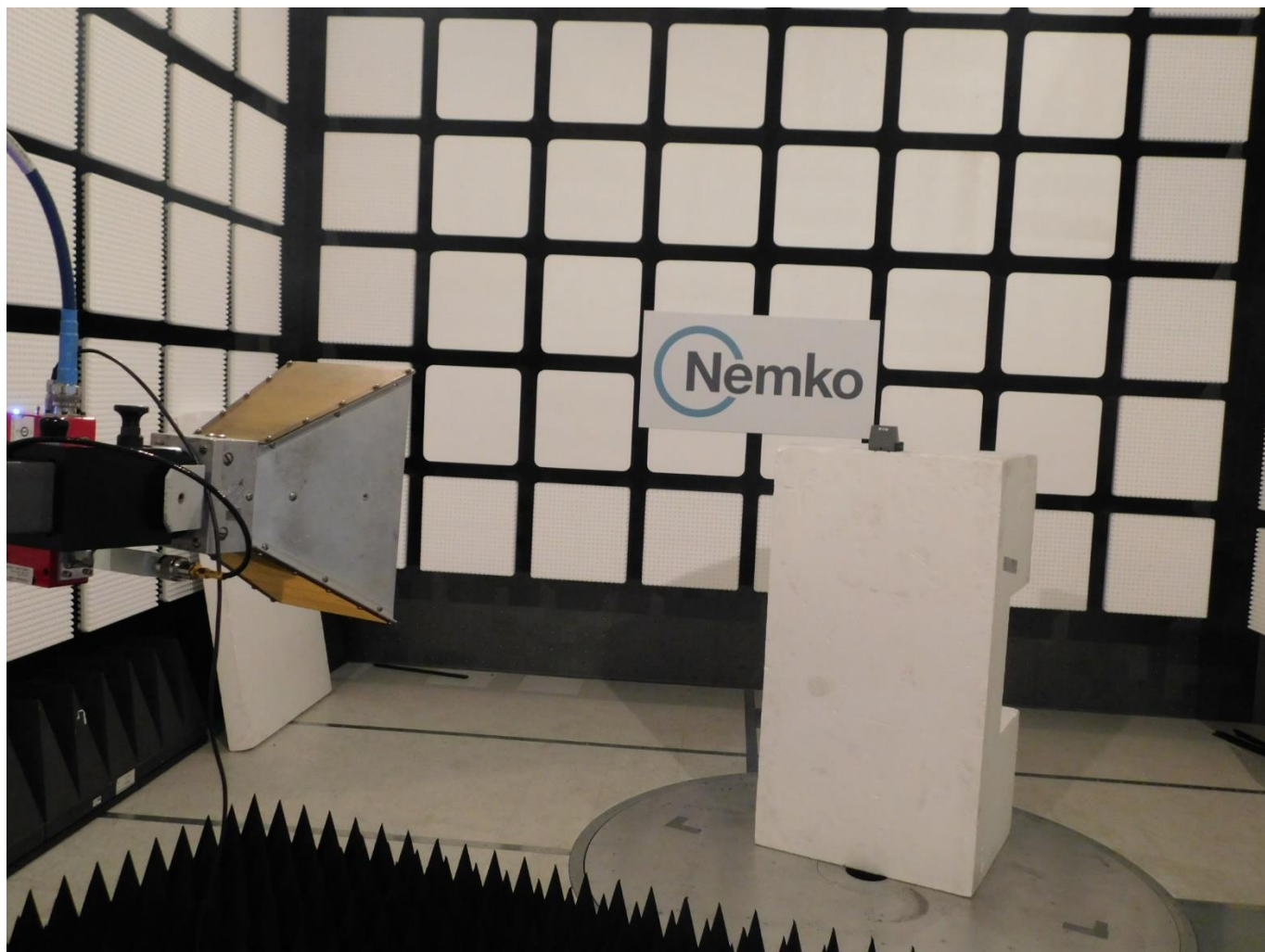
Radiated 1-10 GHz ALF-000044 (Flowie)