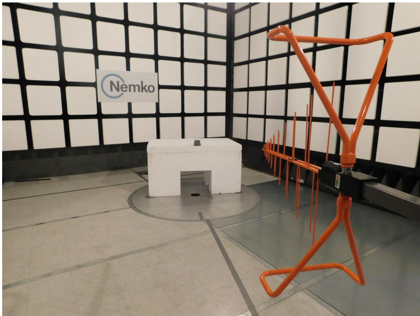
Radiated 30 MHz – 1 GHz ALF-000044 (Flowie)