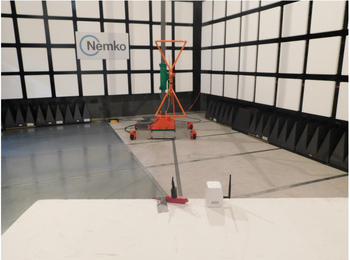
Radiated 30 MHz – 1 GHz ALF-000045 (sensor)