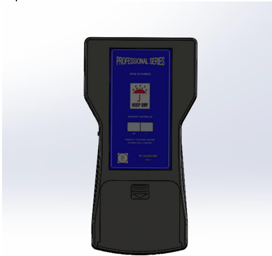
Figure 3. Battery Placement

The BATTERY COMPARTMENT holds the one 9 volt alkaline battery used to power the reader. The BATTERY COVER is shown in its CLOSED position in FIGURE 3 .