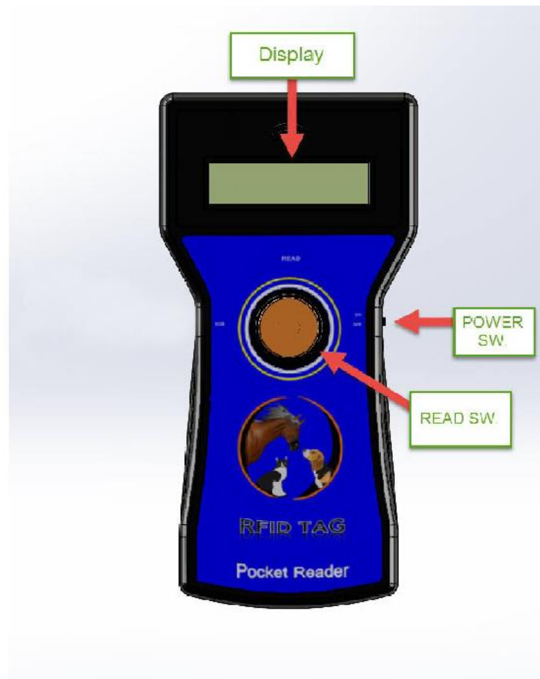
Figure 1. Hero Identity Tag Reader