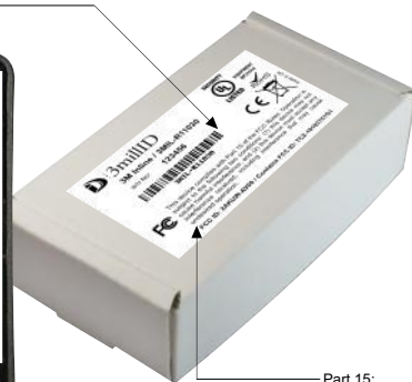
LABEL 2 - BOX