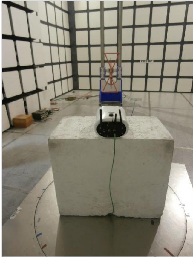
Figure 5 Radiated Spurious Emissions 30MHz – 1GHz