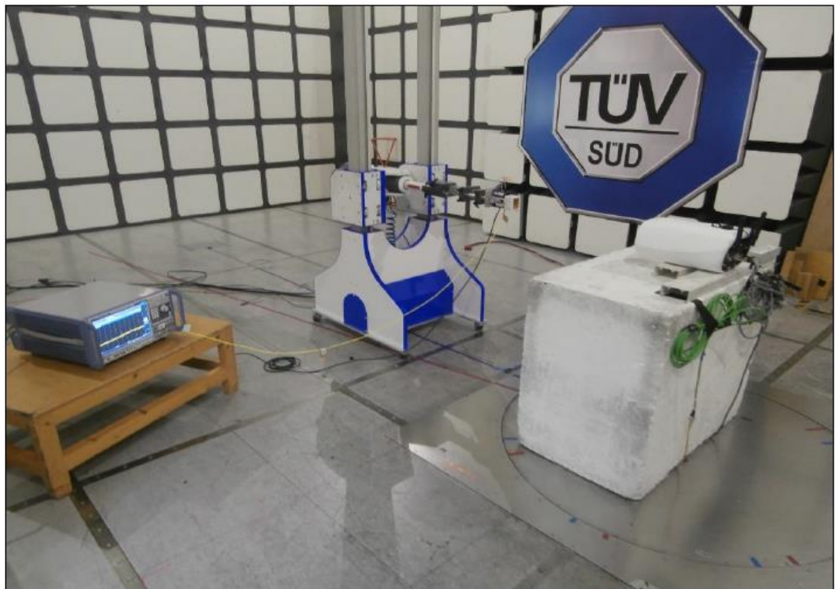
Figure 4 Radiated Disturbance above 18GHz