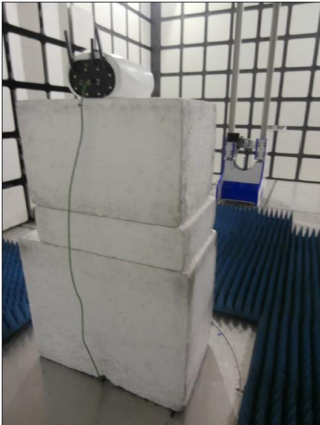
Figure 6 Radiated Spurious Emissions 1GHz – 8GHz