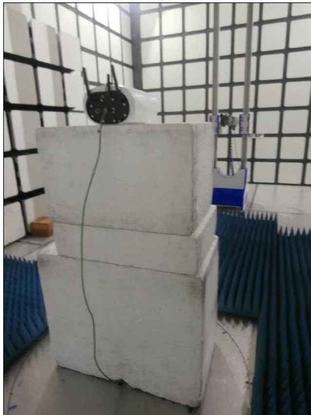
Figure 8 Radiated Spurious Emissions 18GHz – 40GHz