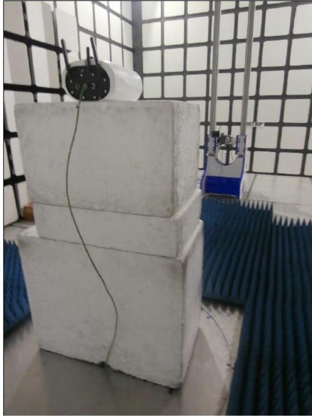
Figure 7 Radiated Spurious Emissions 8GHz – 18GHz