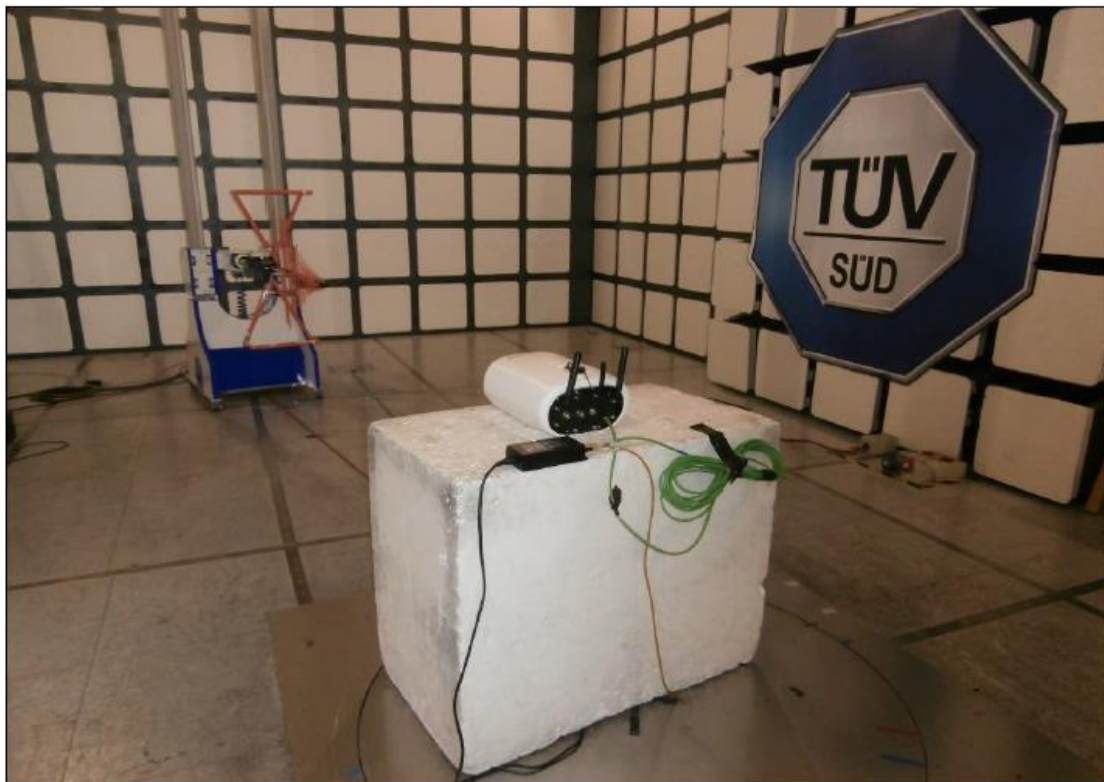
Figure 2 Radiated Disturbance 30MHz – 1GHz