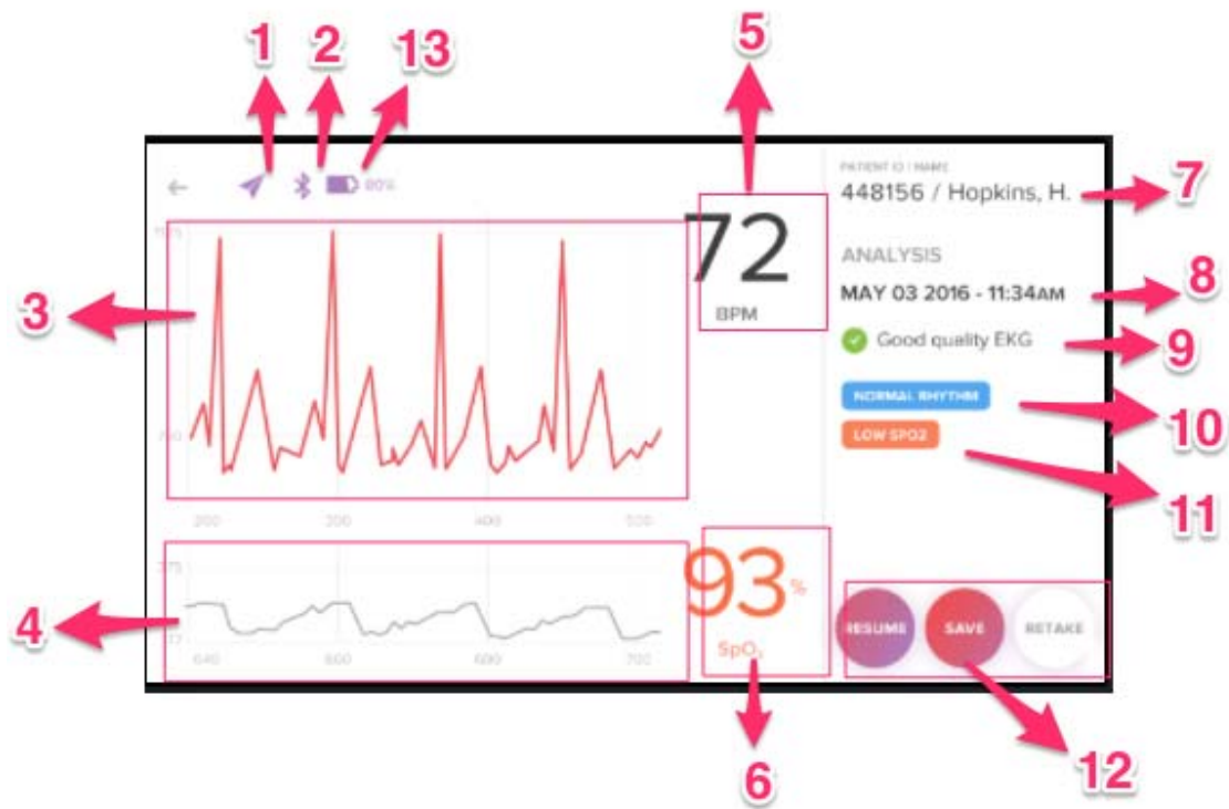
Figure 12. Schematic Diagram of Display