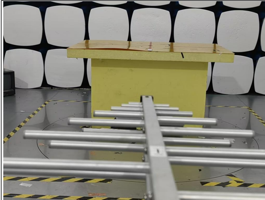
Radiated spurious emissions at frequencies up to 1 GHz