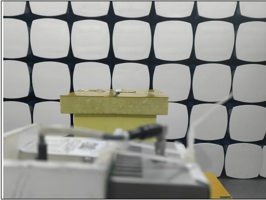
Radiated spurious emissions at frequencies above 18GHz