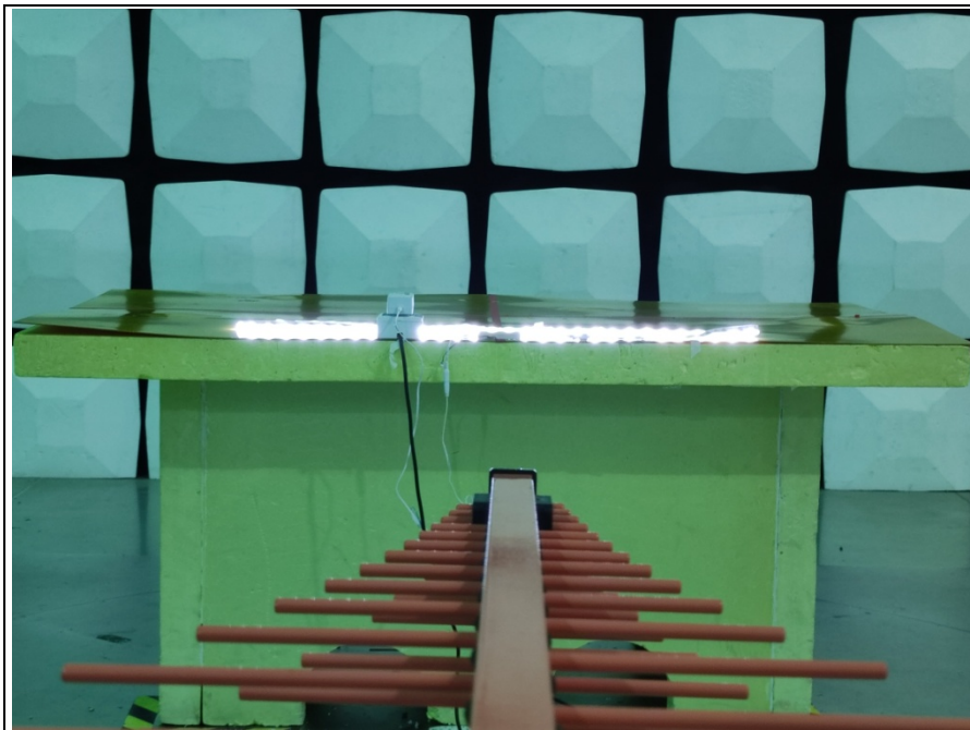
Radiated spurious emissions at frequencies up to 1 GHz