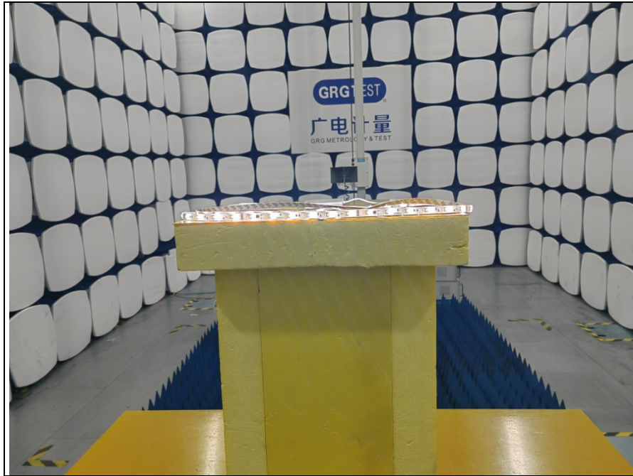
Radiated spurious emissions at frequencies 1GHz to 18GHz