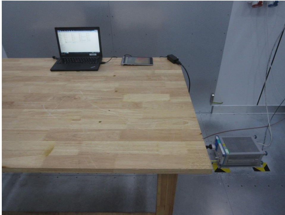
Radiated Emission Test below 1GHz