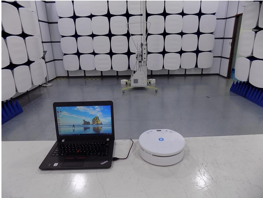
Photos of Radiated emission