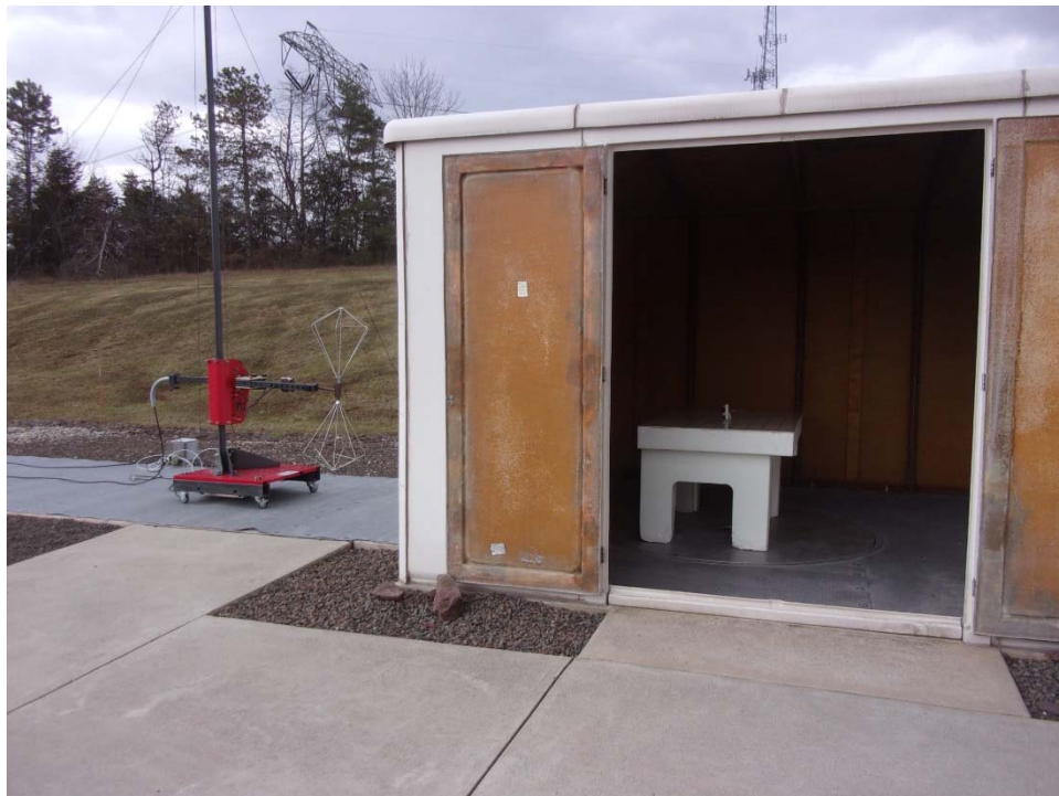
Vertical Antenna Polarization, 30 to 200 MHz