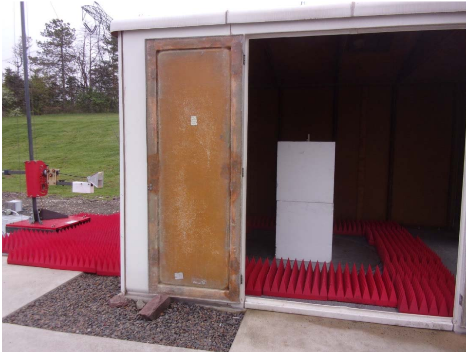
Horizontal Antenna Polarization, Above 1 GHz