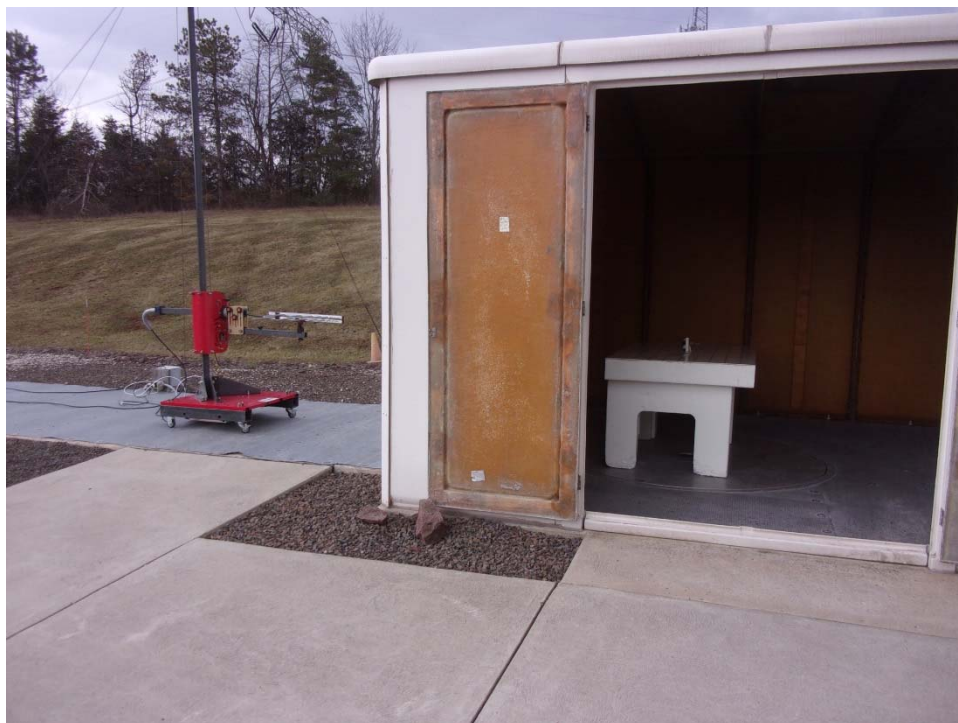
Horizontal Antenna Polarization, 200 MHz to 1 GHz