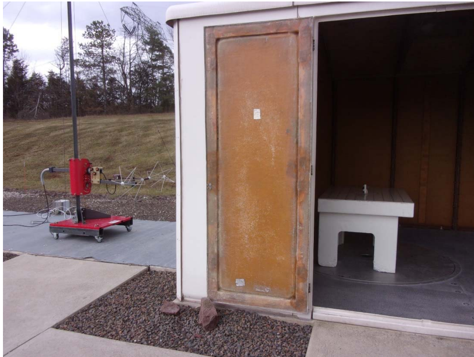
Horizontal Antenna Polarization, 30 to 200 MHz