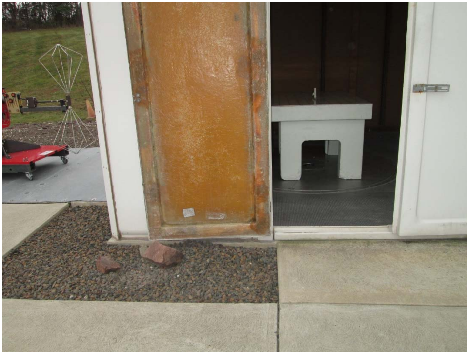
Vertical Antenna Polarization, Below 1 GHz