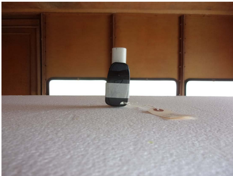
Test Setup, X Axis, Above 1 GHz