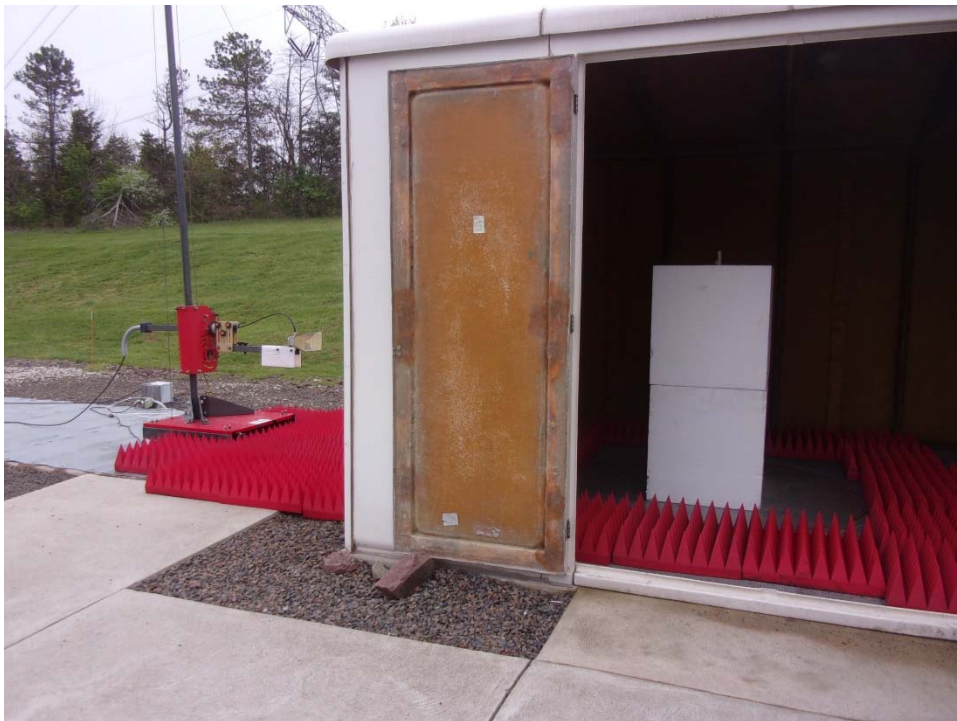
Vertical Antenna Polarization, Above 1 GHz