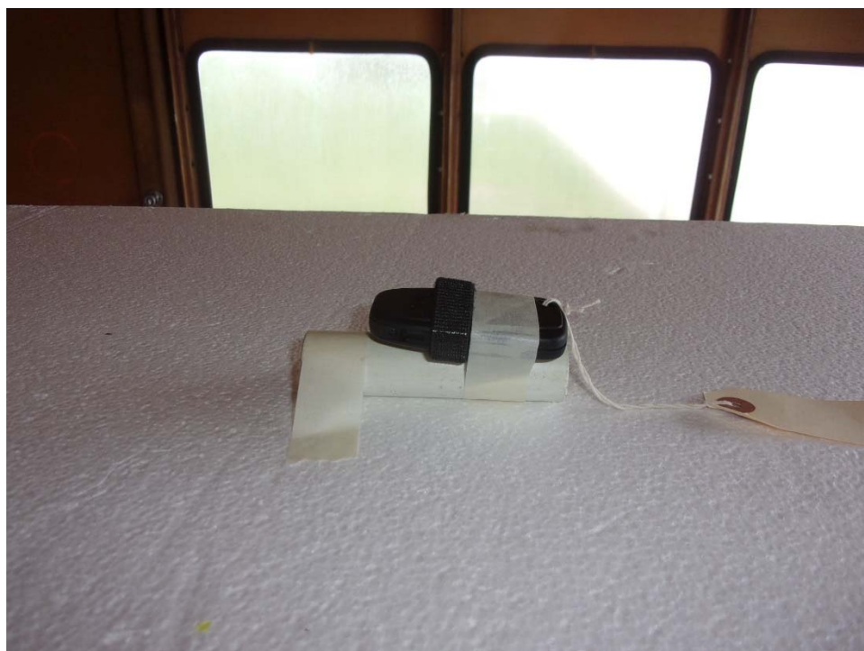
Test Setup, Y Axis, Above 1 GHz