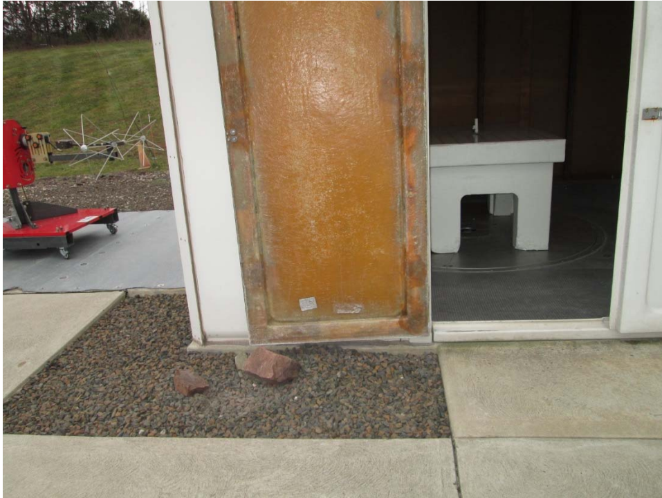
Horizontal Antenna Polarization, Below 1 GHz