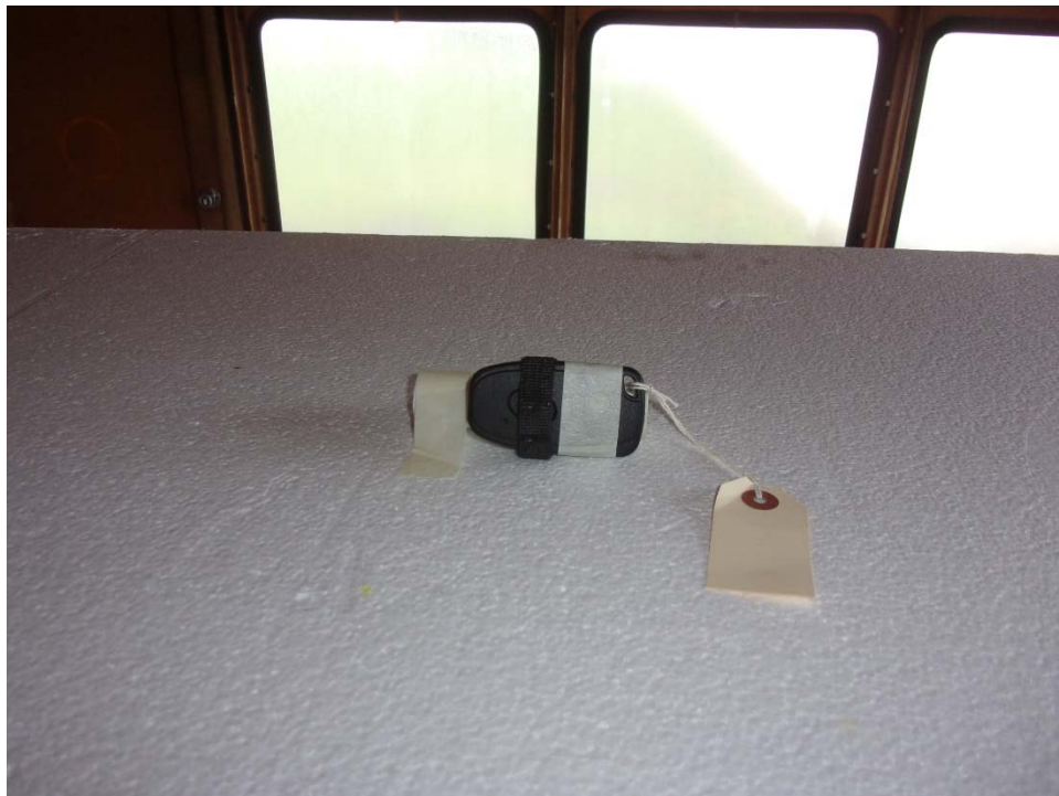
Test Setup, Z Axis, Above 1 GHz