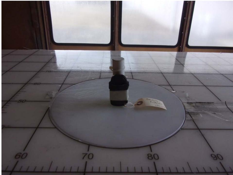
Test Setup, X Axis