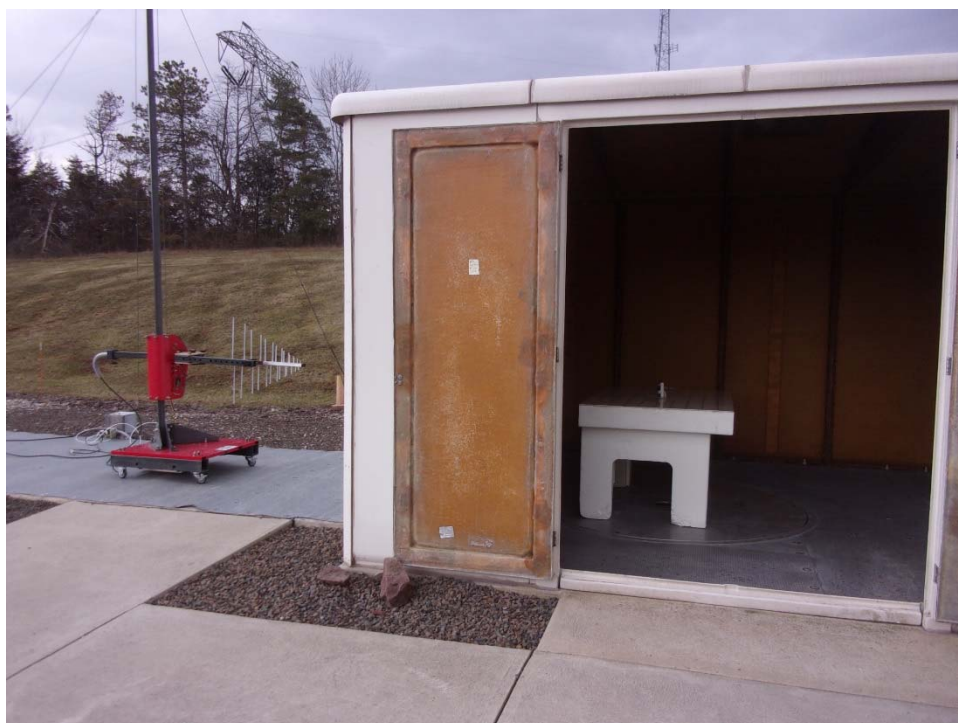
Vertical Antenna Polarization, 200 MHz to 1 GHz