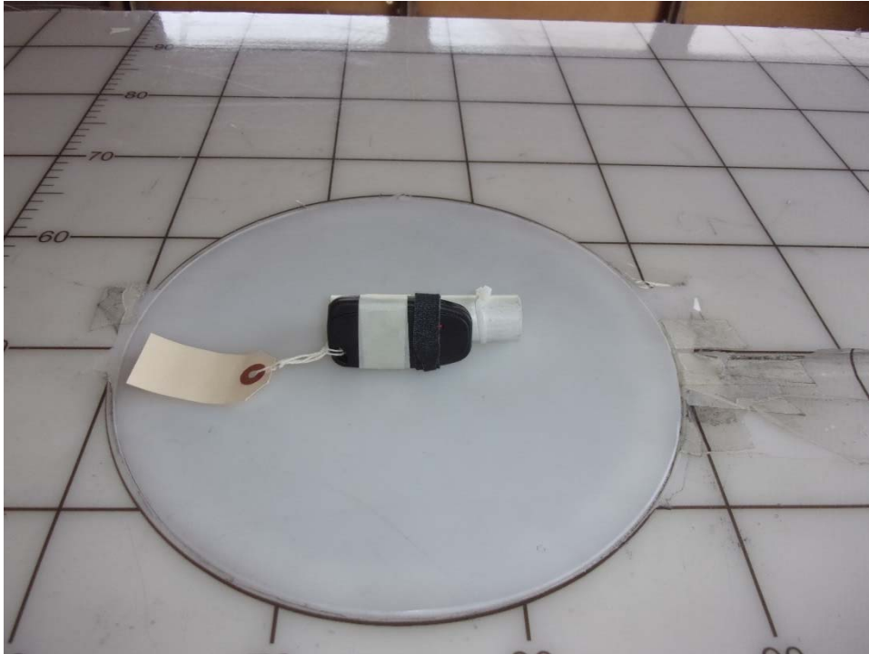
Test Setup, Z Axis