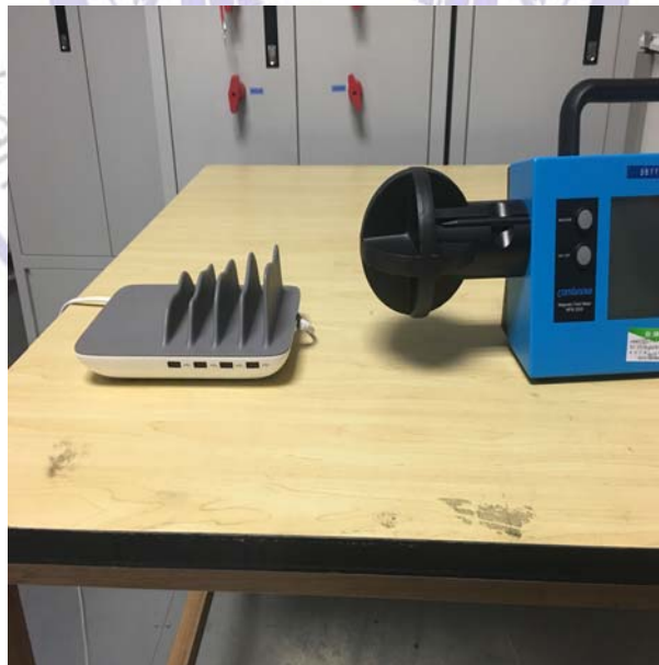
Test Setup Photo