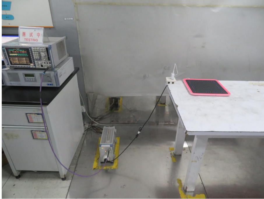
Conducted Emissions Test Setup(QC01)