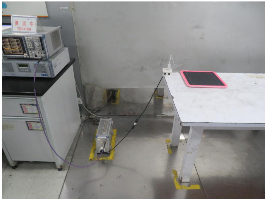
Conducted Emissions Test Setup(GE0151U-050300)