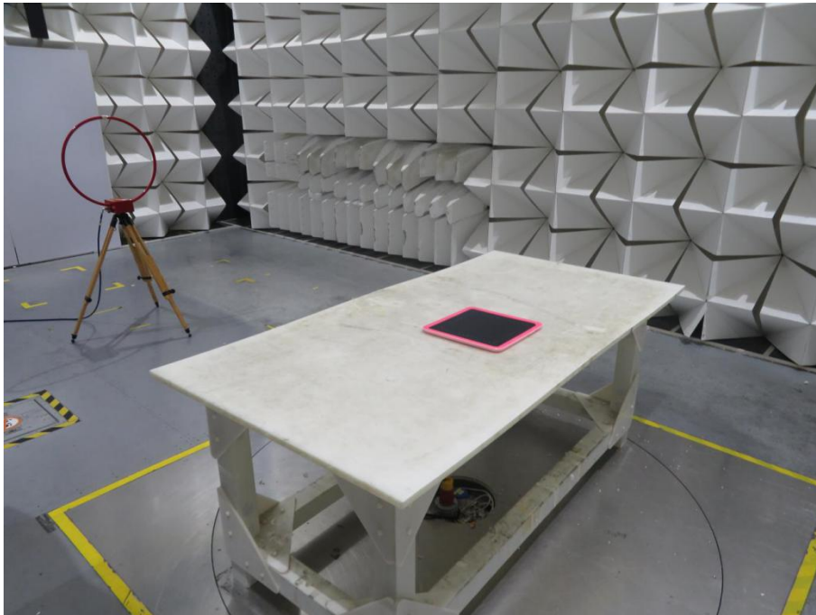
Radiated spurious emission Test Setup-2(Below 30M)