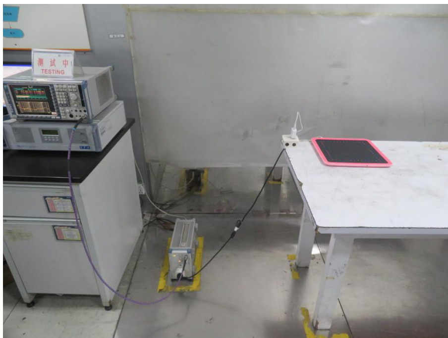
Conducted Emissions Test Setup(QC01)