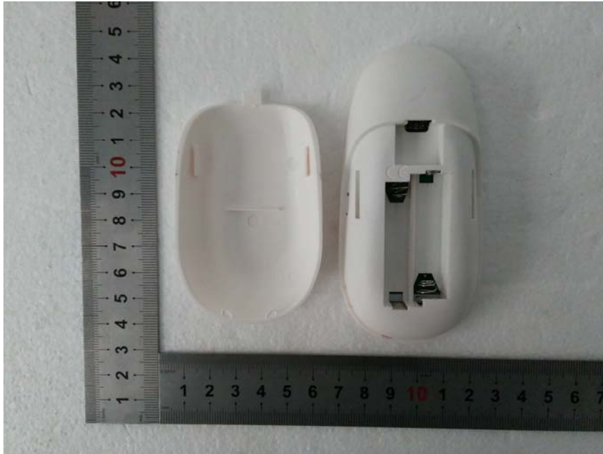
EUT – Cover off View-2