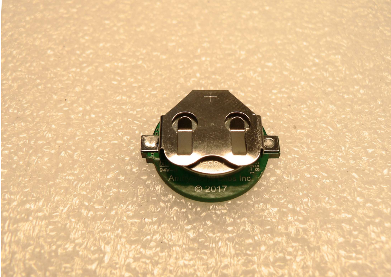
CT105 PCB Back