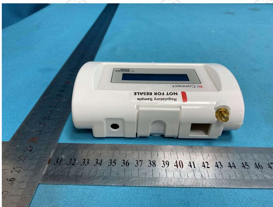
View of Product-6