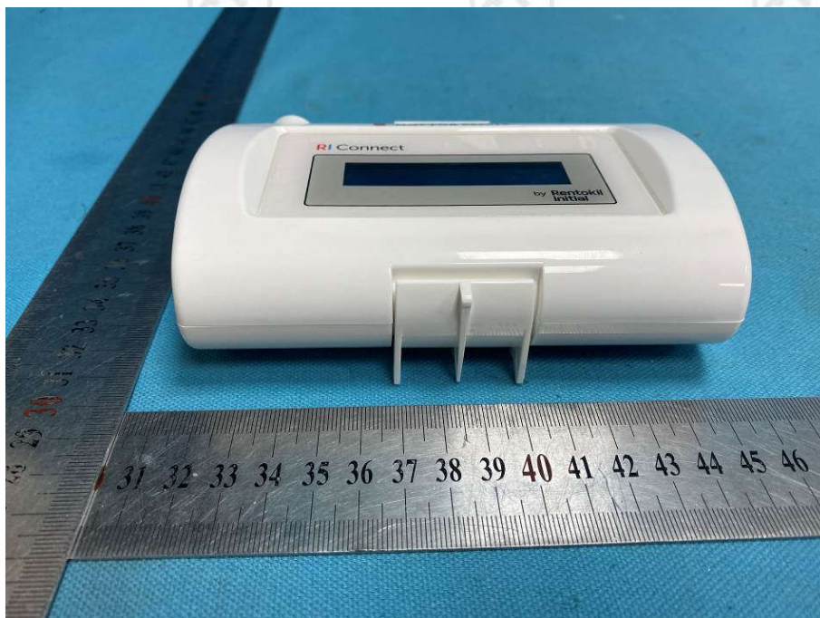
View of Product-4