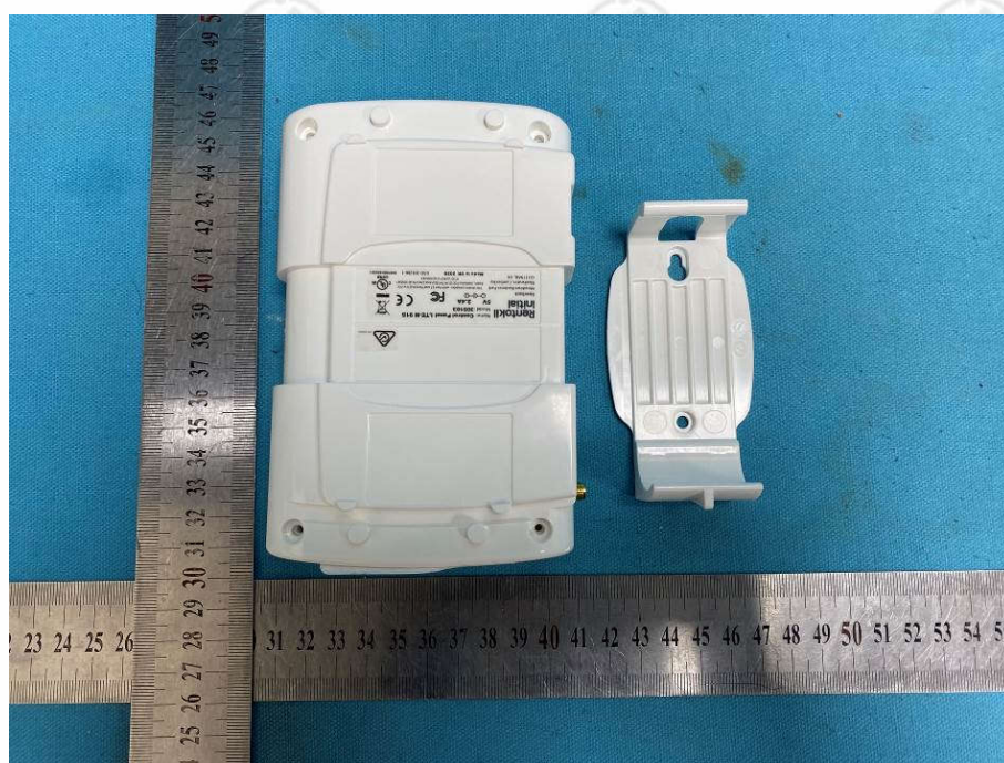
View of Product-8