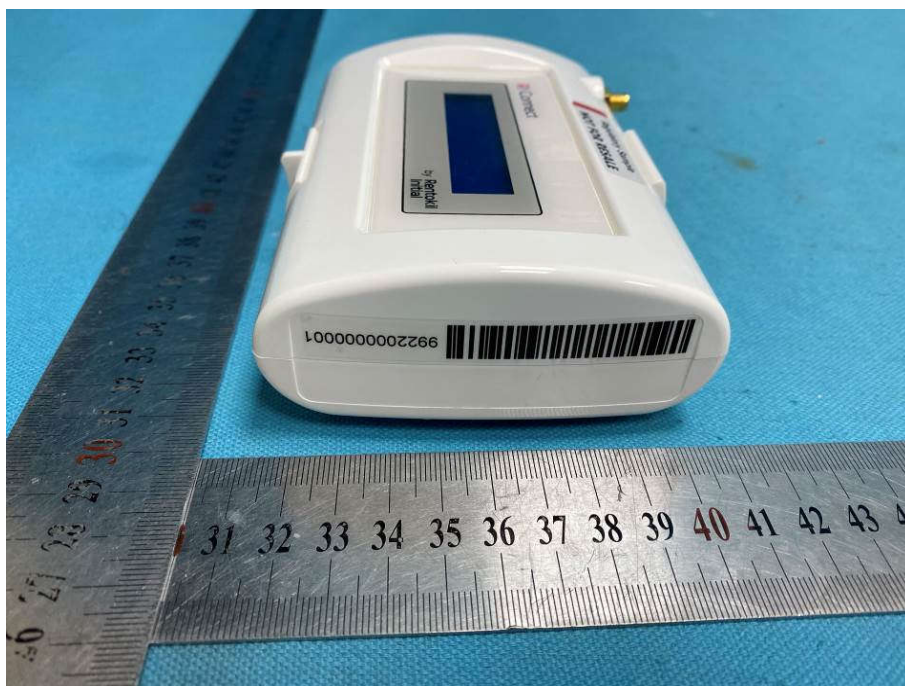
View of Product-5