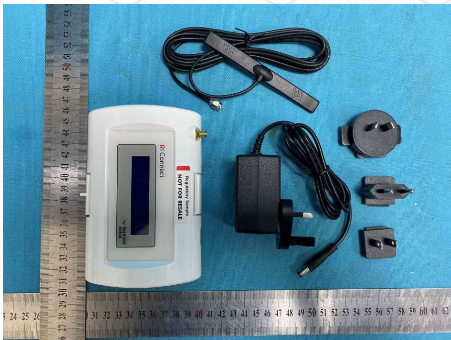
View of Product-1