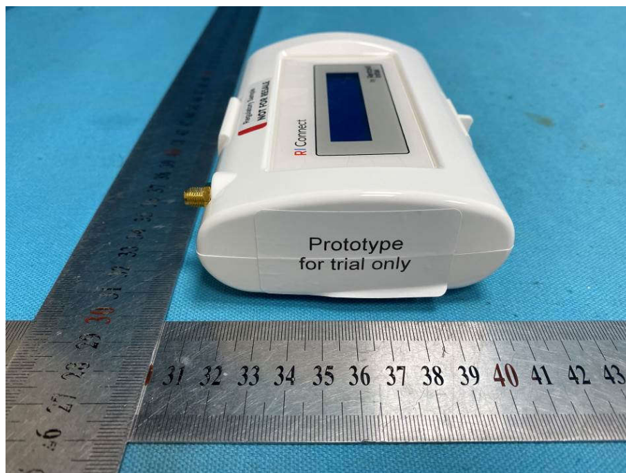
View of Product-7