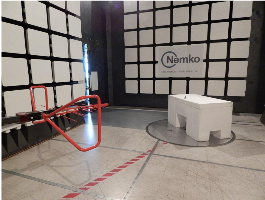
Radiated spurious (out-of-band) emissions setup photo – 30 to 1000 MHz