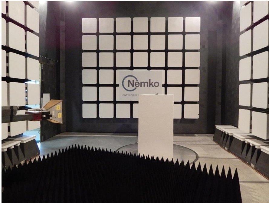
Radiated spurious (out-of-band) emissions setup photo – above 1 GHz