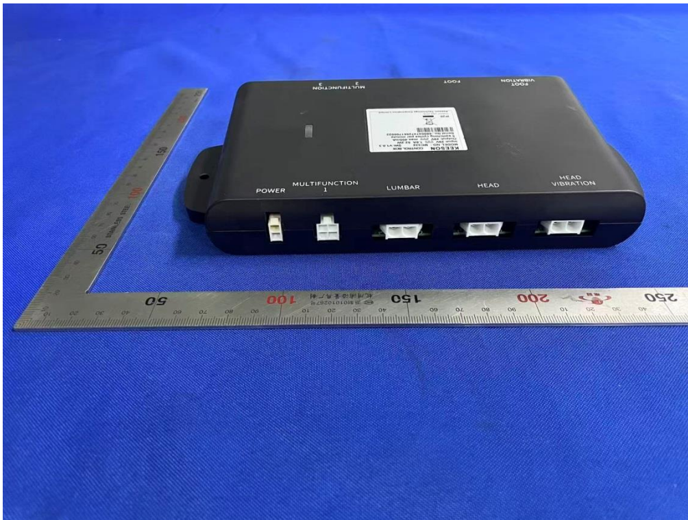
Front of the sample