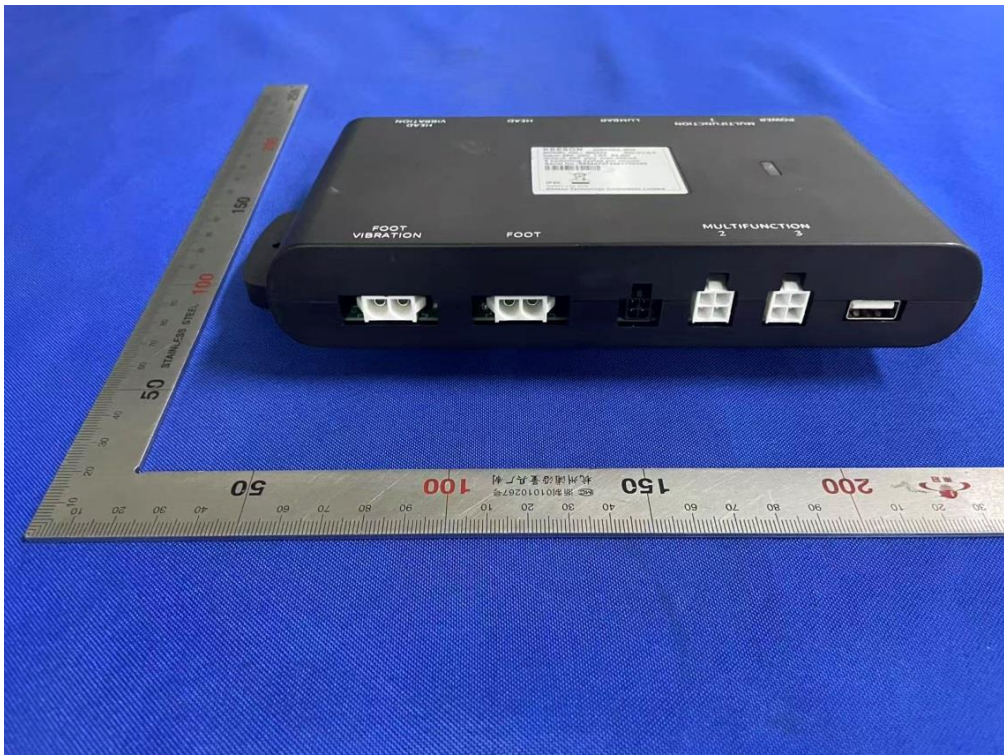
Rear of the sample