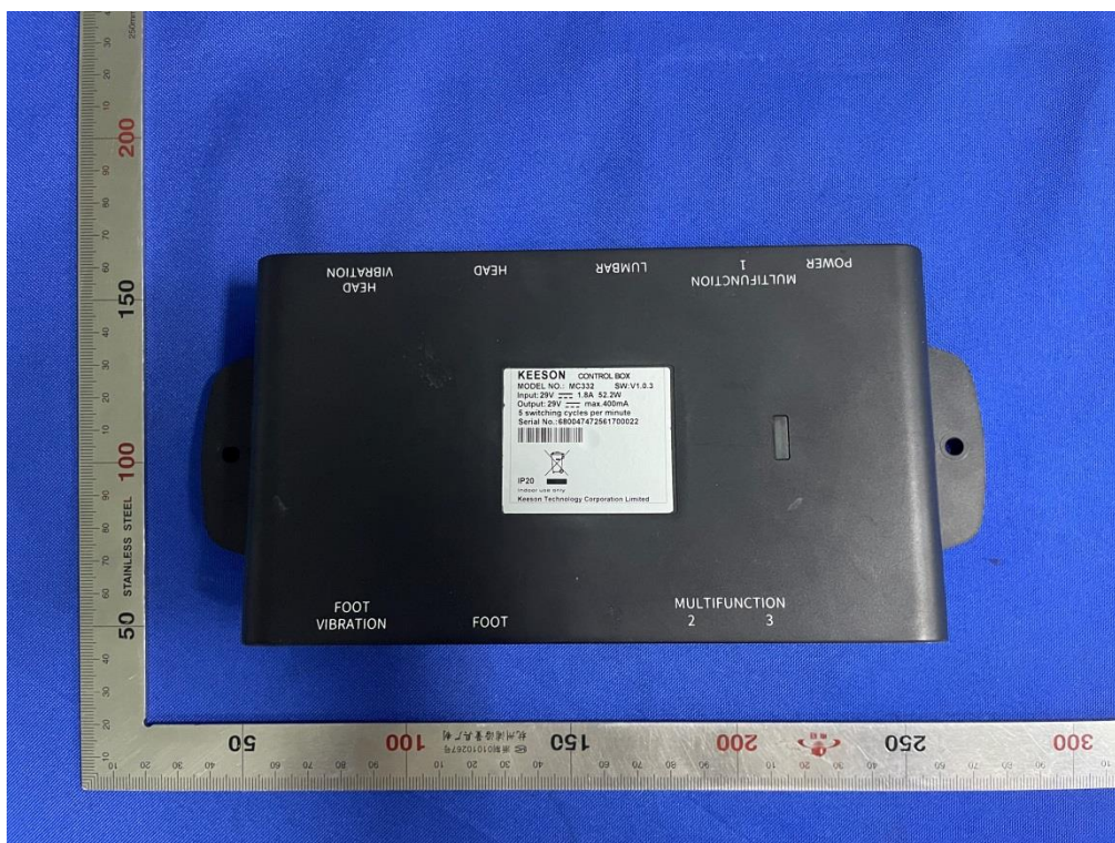
Top of the sample