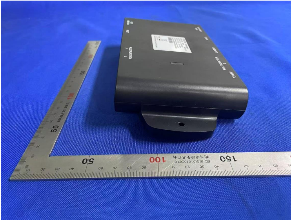
Left of the sample