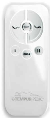
Remote Control JLDK.30.04.05