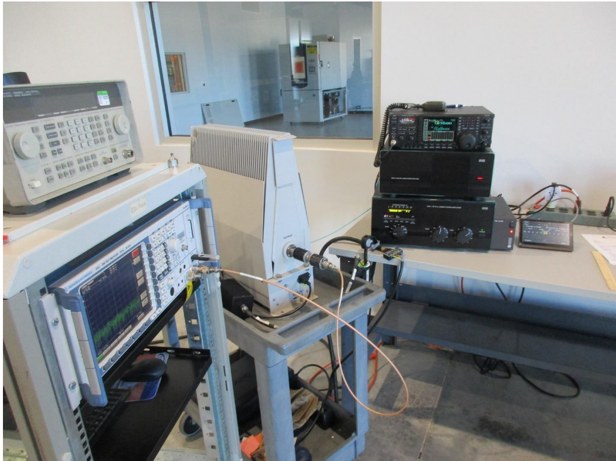
Conducted Test Setup

Acom Ltd. Model: A1400S FCC ID: 2AJXZ1400S