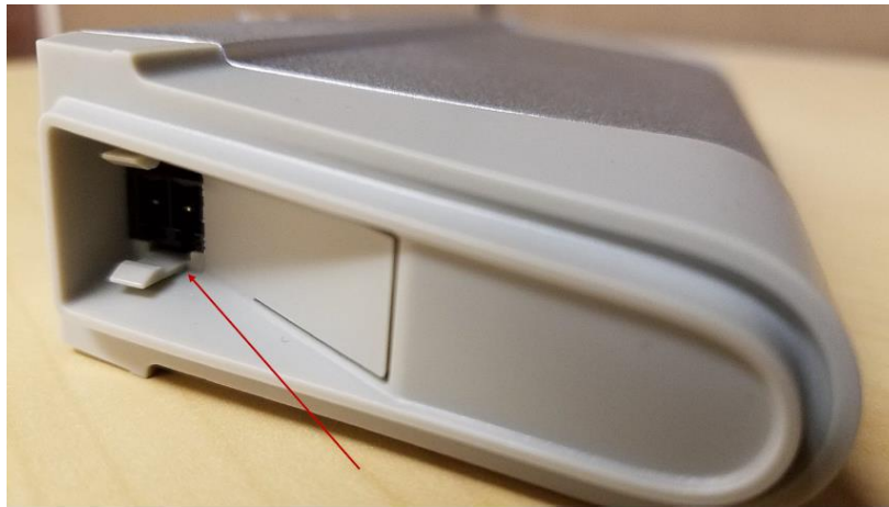
Input Power Port