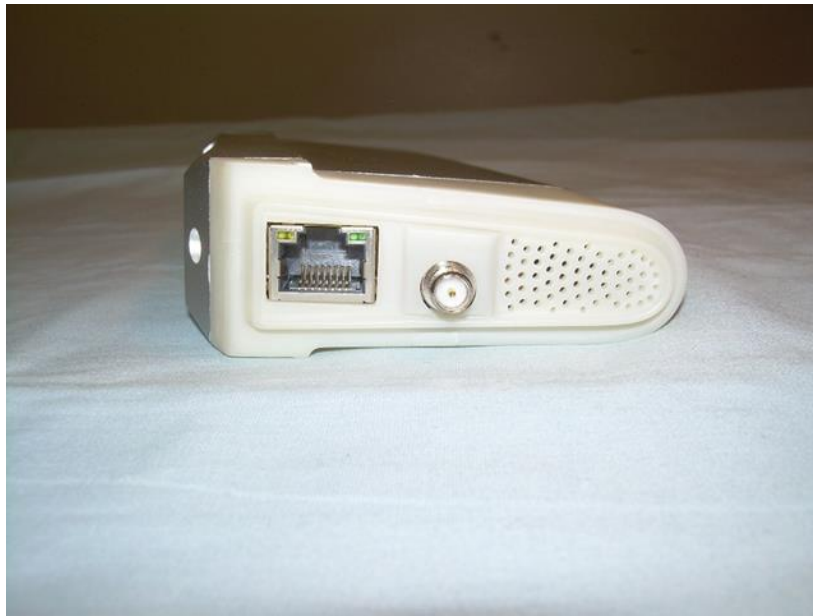
Photograph 4 – Left Side of the EUT (Ethernet Port)