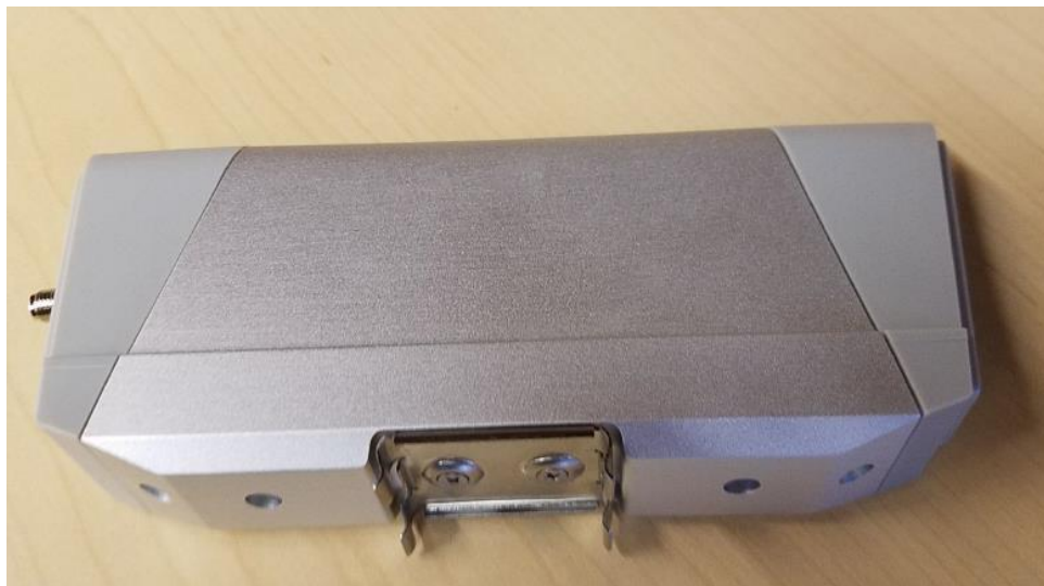
Photograph 3 - Back/Bottom View of the EUT