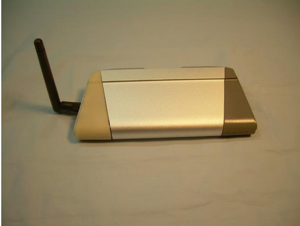
Photograph 1 – Front View of the EUT