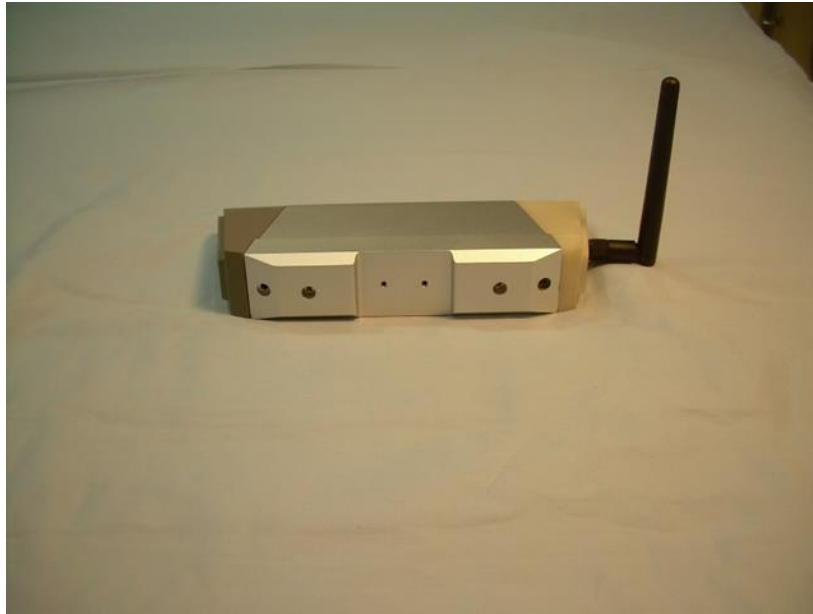
Photograph 2 – Back View of the EUT