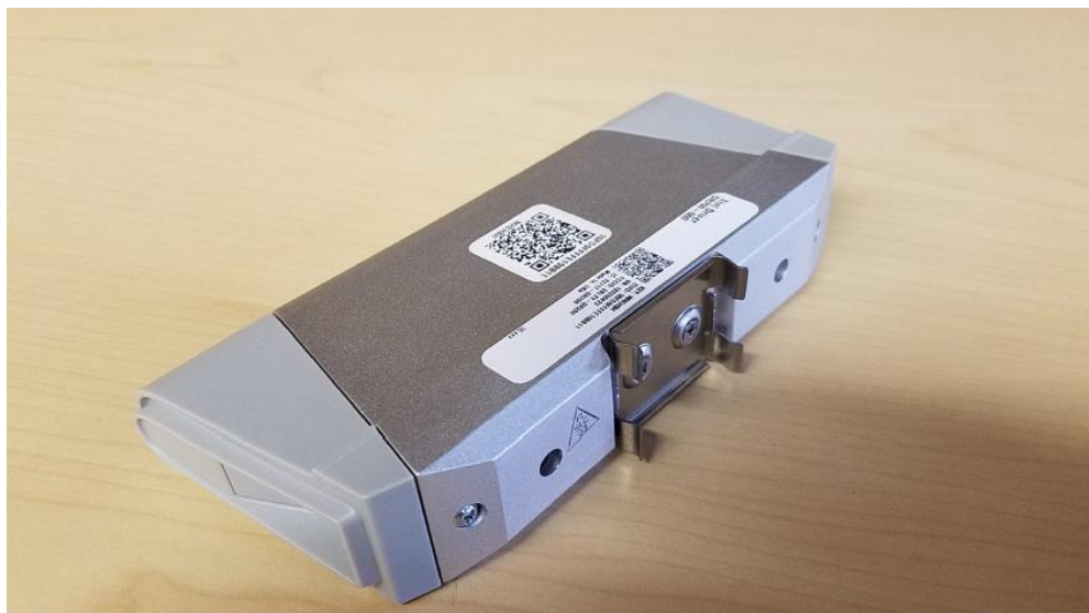
Photograph 2 – Top/Back View