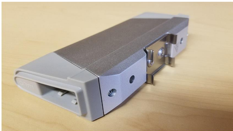
Photograph 4 – Bottom/Back View