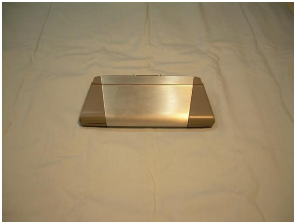
Photograph 1 – Front View of the EUT