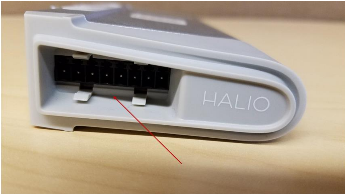
Output Power and Sense Port