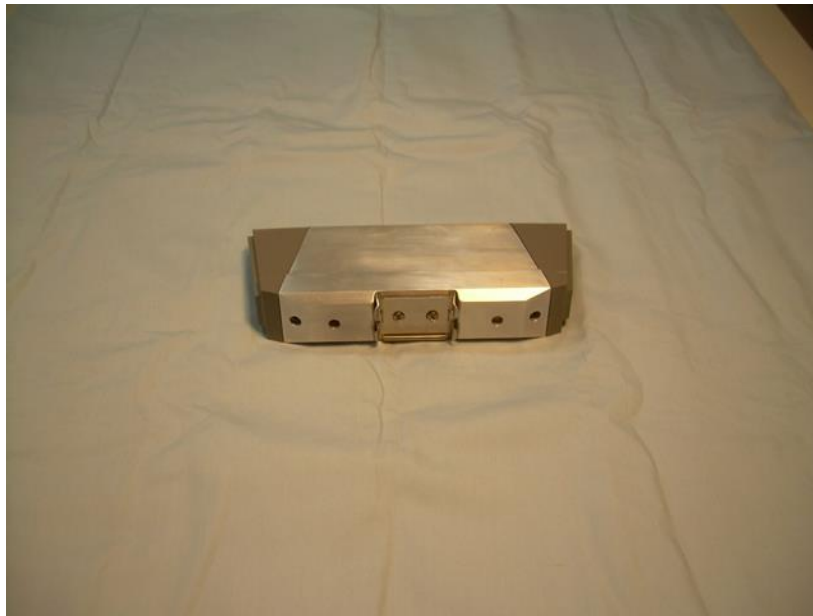
Photograph 3 – Back View of the EUT