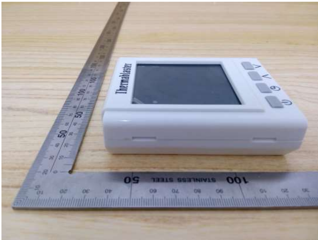
Right View of EUT