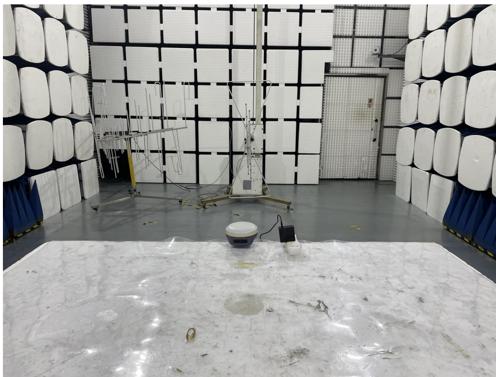
Fig. 2 (30MHz~1GHz)