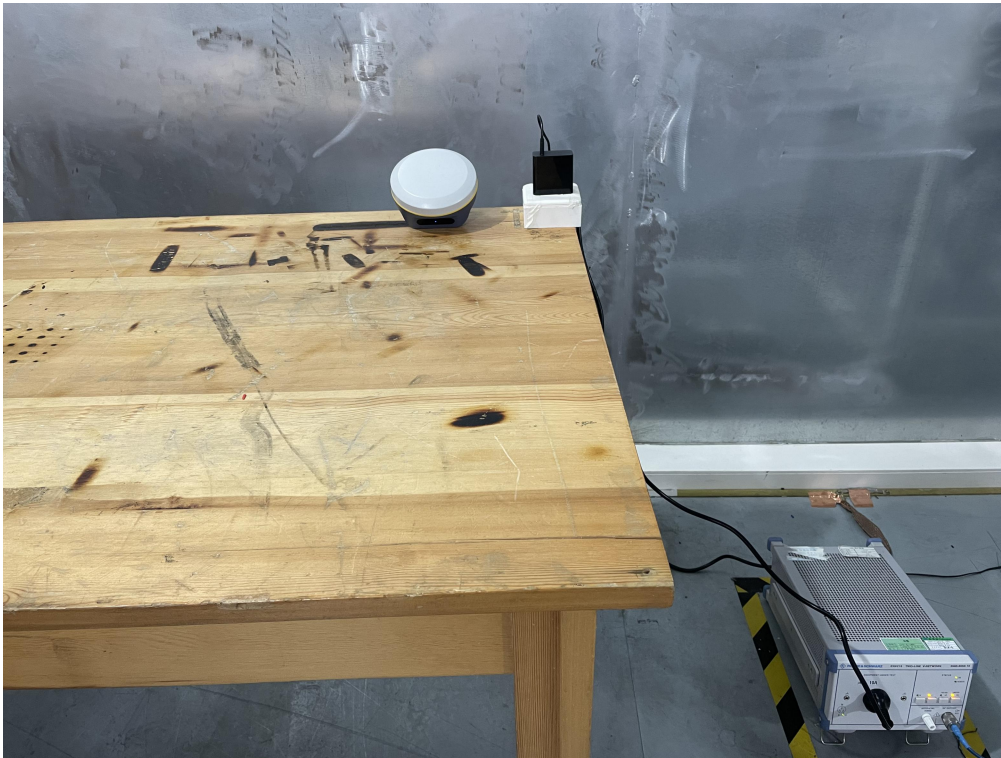
AC Conducted Emission of charge from power adapter mode