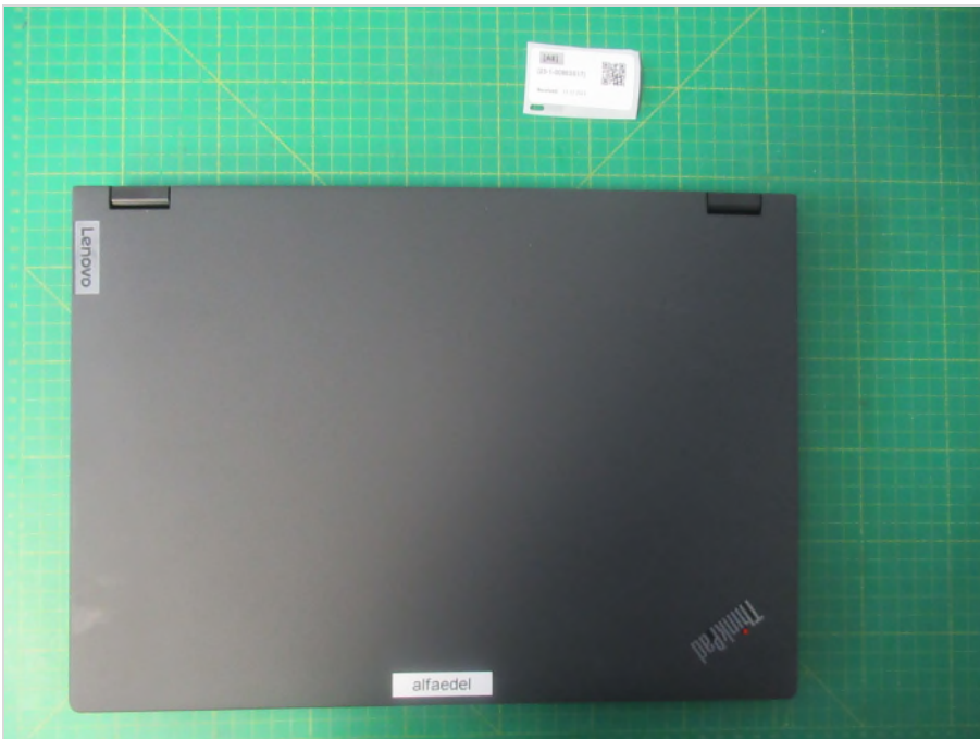
Photograph 10: AE 1