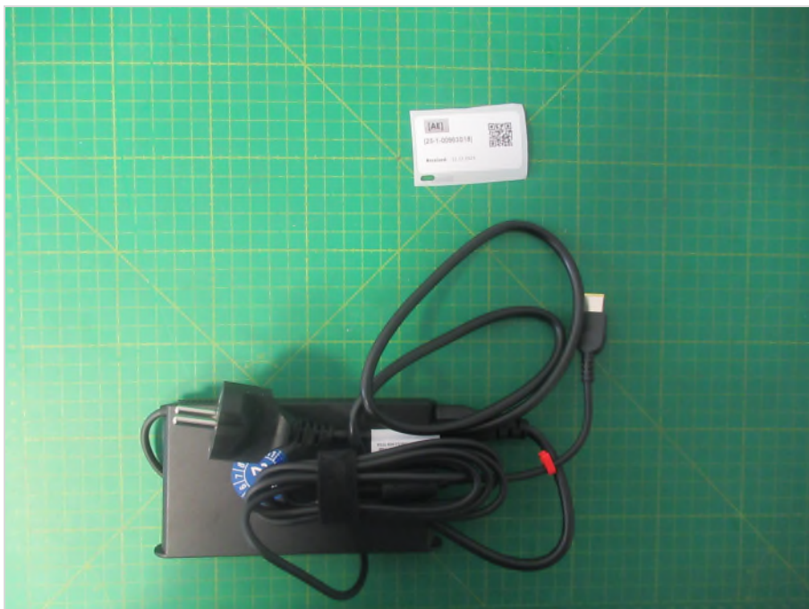
Photograph 11: AE 2