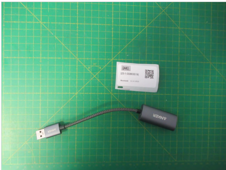
Photograph 12: AE 3