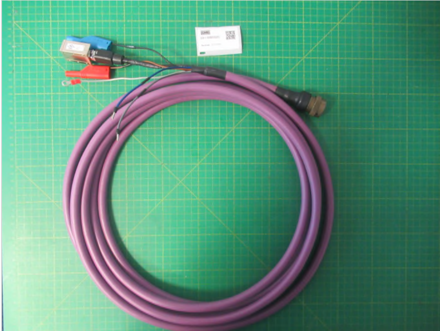
Photograph 9: CAB 1 Cable Harness