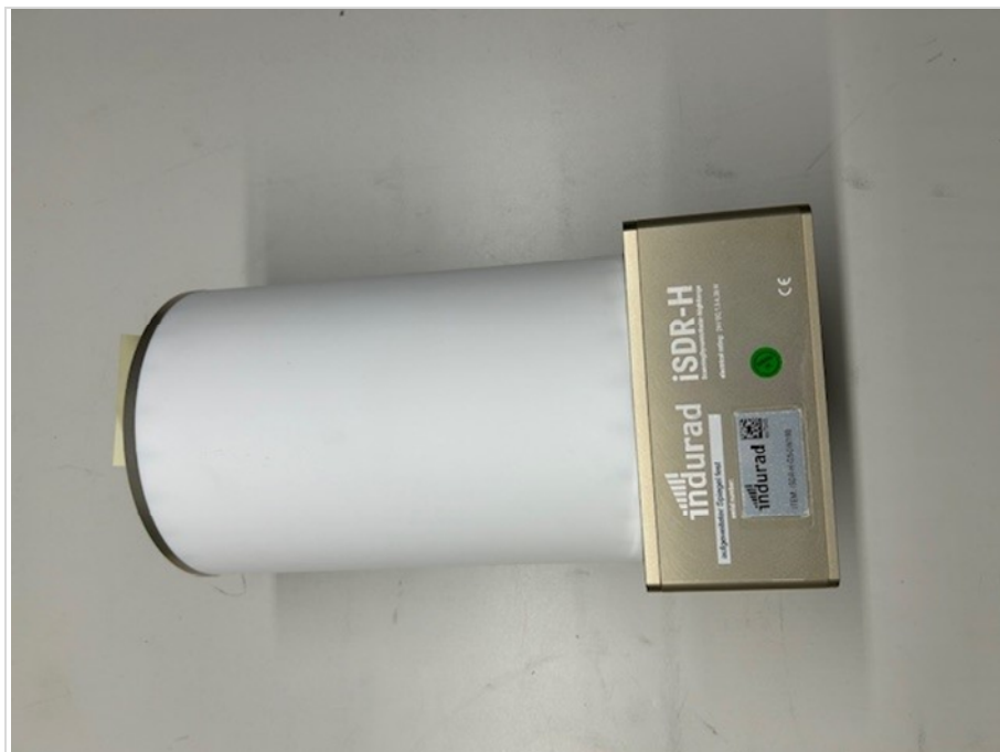
Photograph 8: EUT 2_Right side view