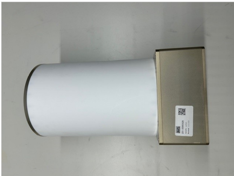
Photograph 7: EUT 2_Left side view