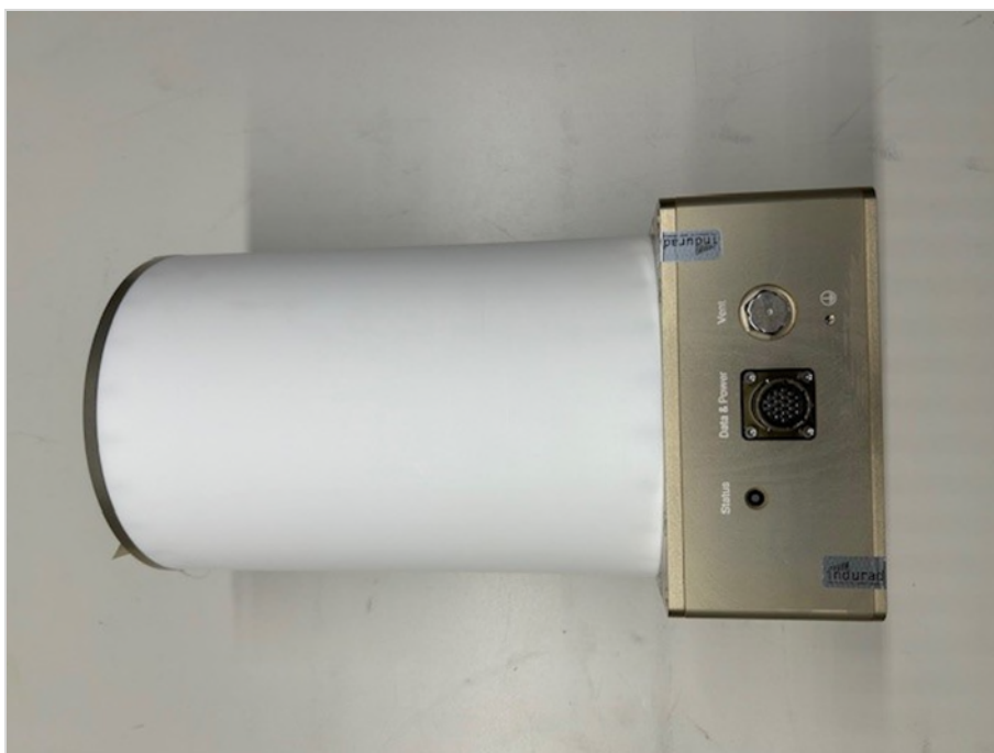
Photograph 6: EUT 2_Rear side/Connector side in respect to measurement