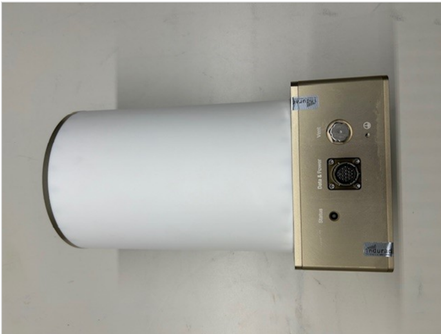
Photograph 2: EUT 1_Rear side/Connector side in respect to measurement