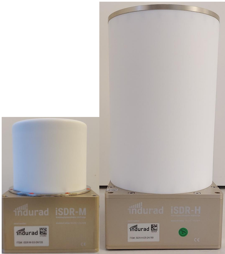
Figure 2: label side: left: iSDR-M-G5-DN135, right: iSDR-H-G5-DN190