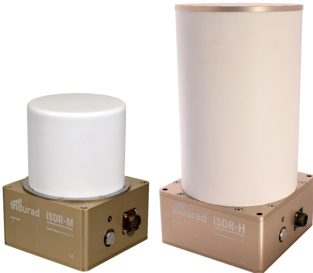
Figure 1: left: iSDR-M-G5-DN135, right: iSDR-H-G5-DN190

The following pictures (Figures 1-5) show various view of the product iSDR-M-G5-DN135 and iSDR-H-G5-DN190. The variation ISDR-M-G5-DN135V and ISDR-H-G5-DN190V variants only have internally a different rotating mirror (see antenna diagram documents). The housing is not changed.