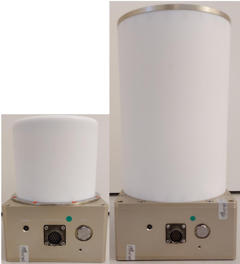
Figure 4: connector side: left: iSDR-M-G5-DN135, right: iSDR-H-G5-DN190