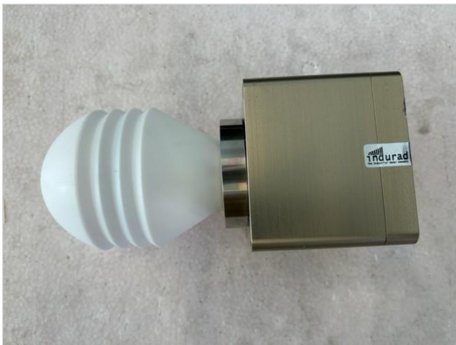
Photograph 6: EUT 2_Bottom side in respect to measurement