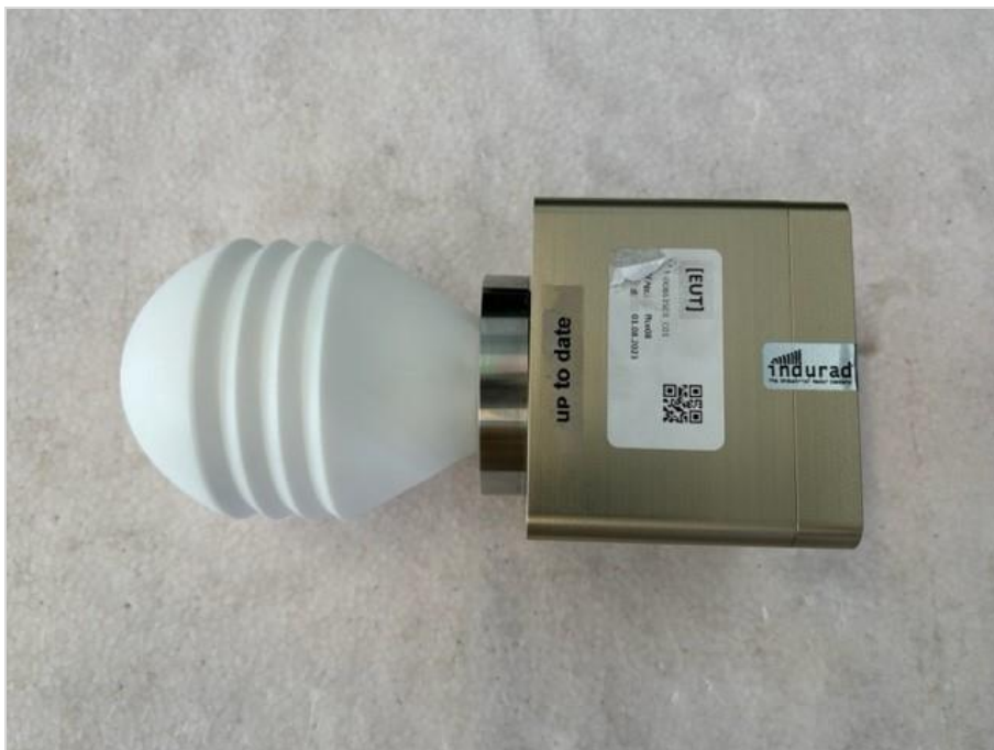
Photograph 5: EUT 2_Top side in respect to measurement