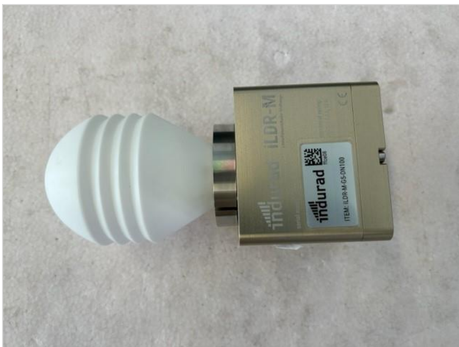
Photograph 3: EUT 1_Left side view