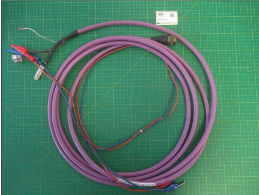
Photograph 7: CAB 1 Cable Harness