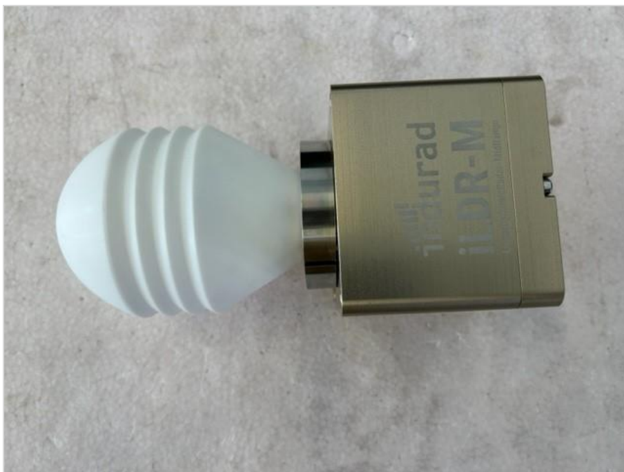
Photograph 4: EUT 1_Right side view