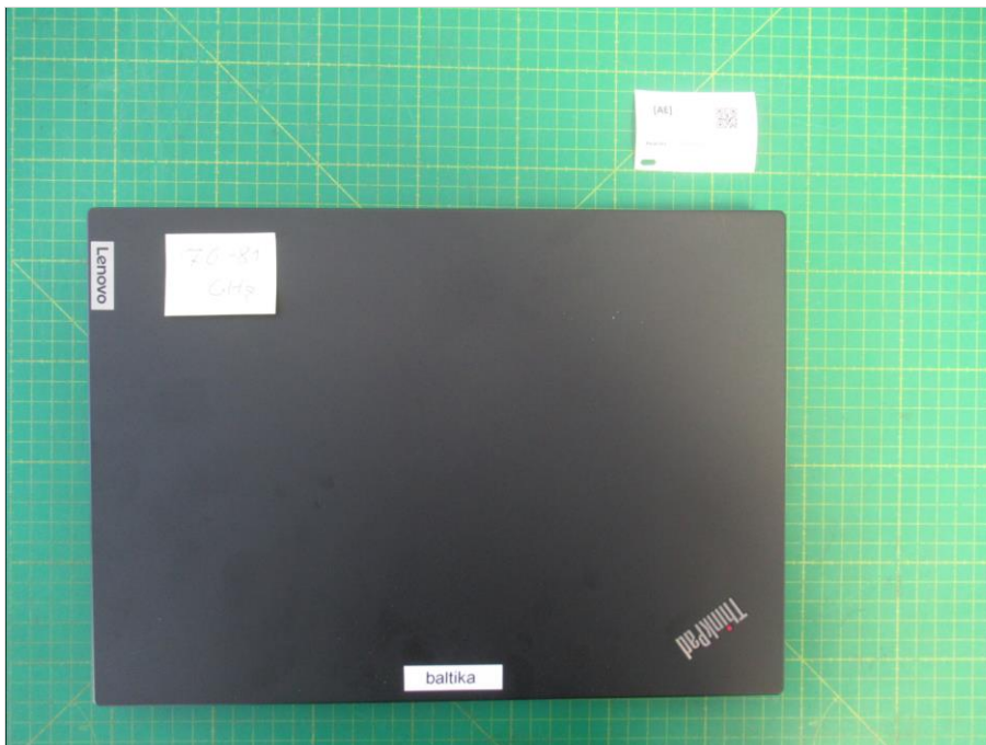
Photograph 8: AE 1