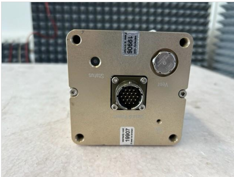
Photograph 2: EUT 1_Rear side/Connector side in respect to measurement