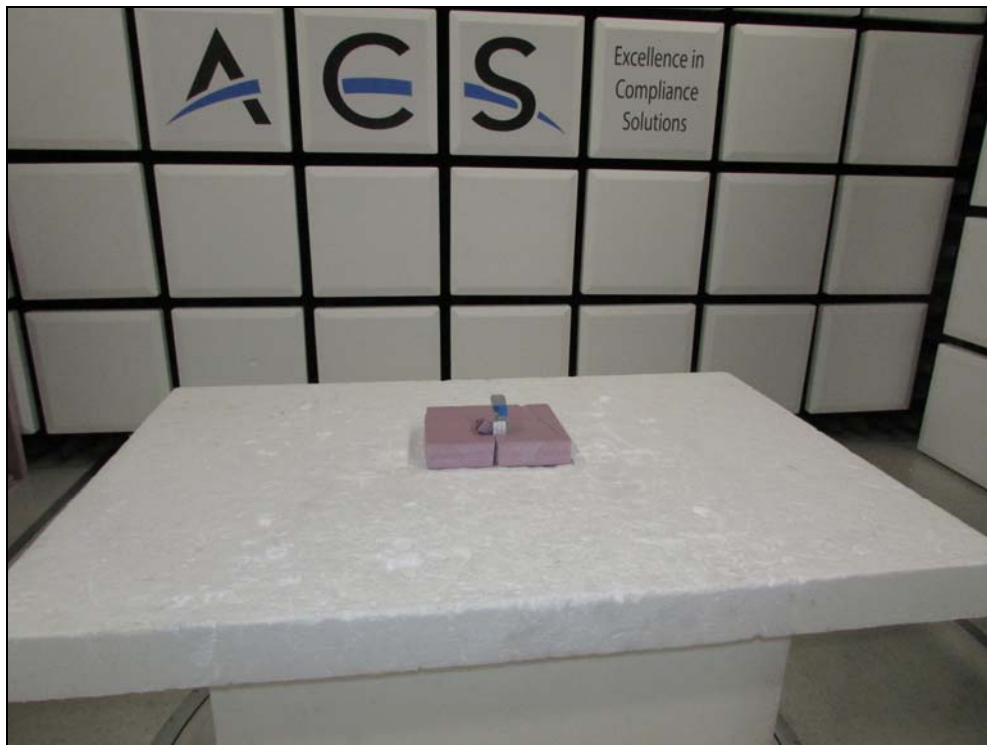
Figure 3: Below 1GHz – Front View