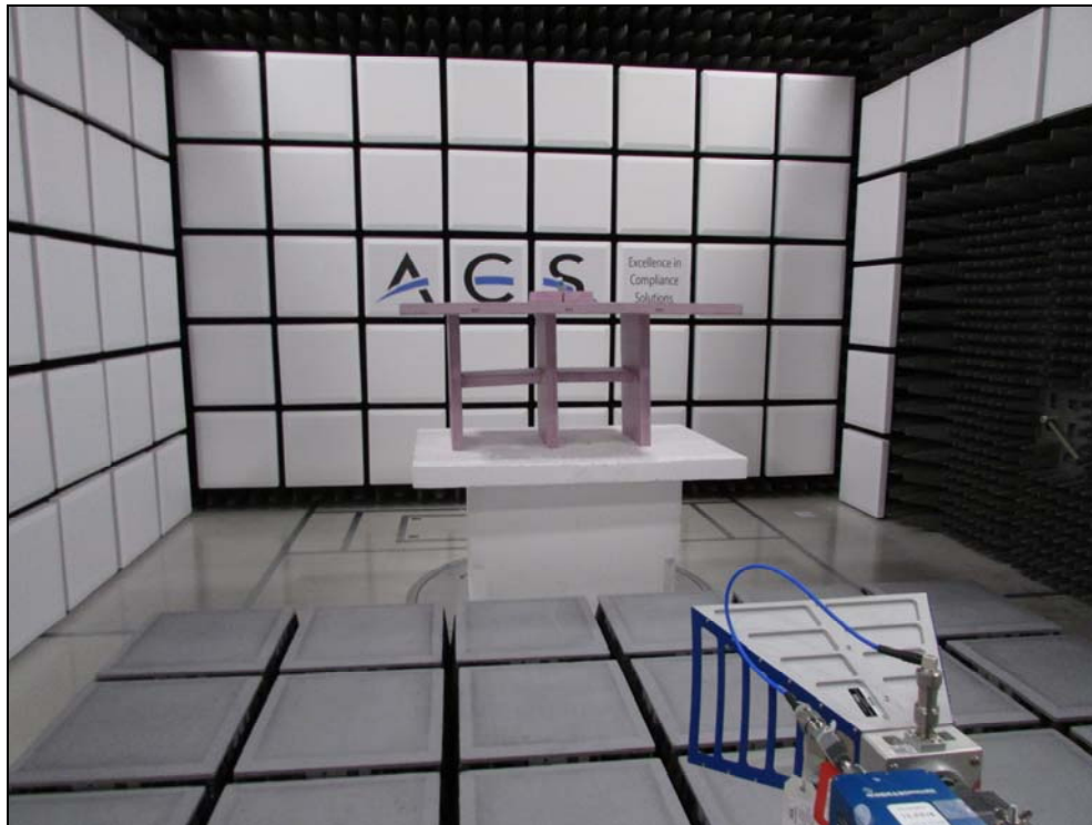
Figure 1: Above 1GHz – Front View