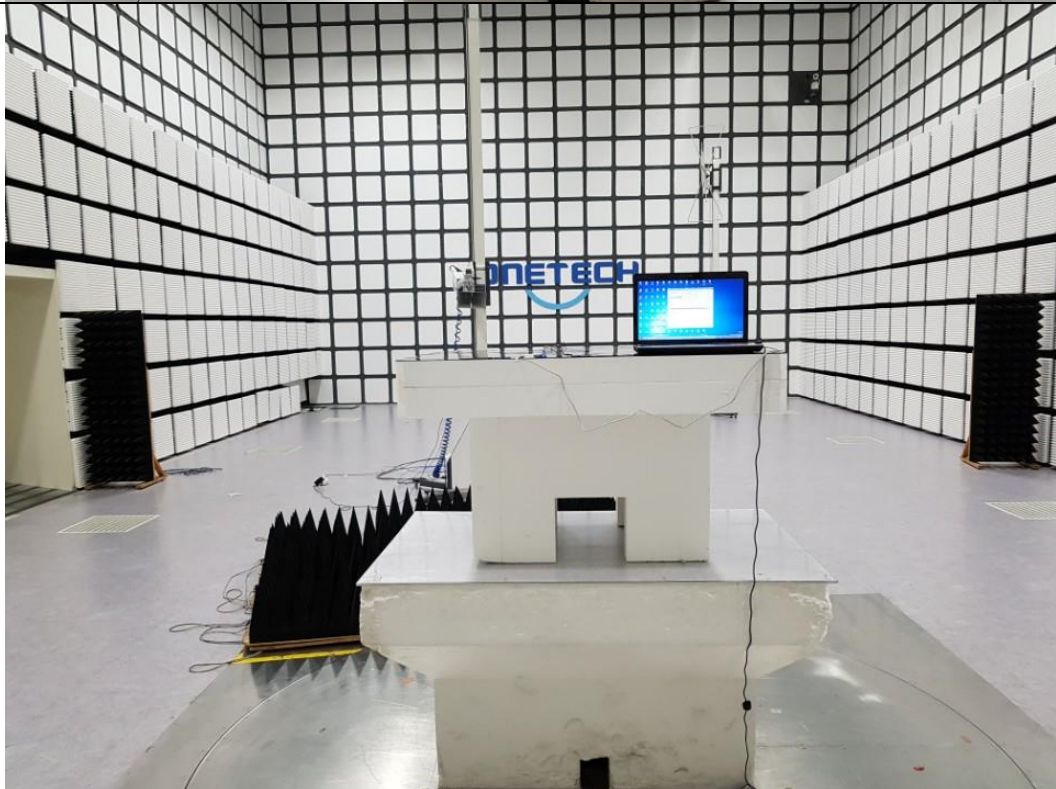
Above 1 GHz