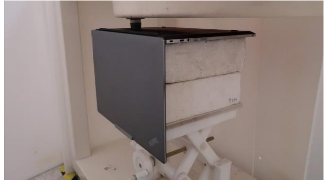
Bottom of Laptop at 30 mm