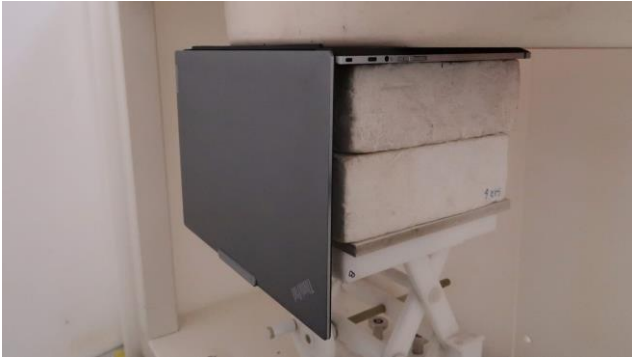
Bottom of Laptop at 0 mm