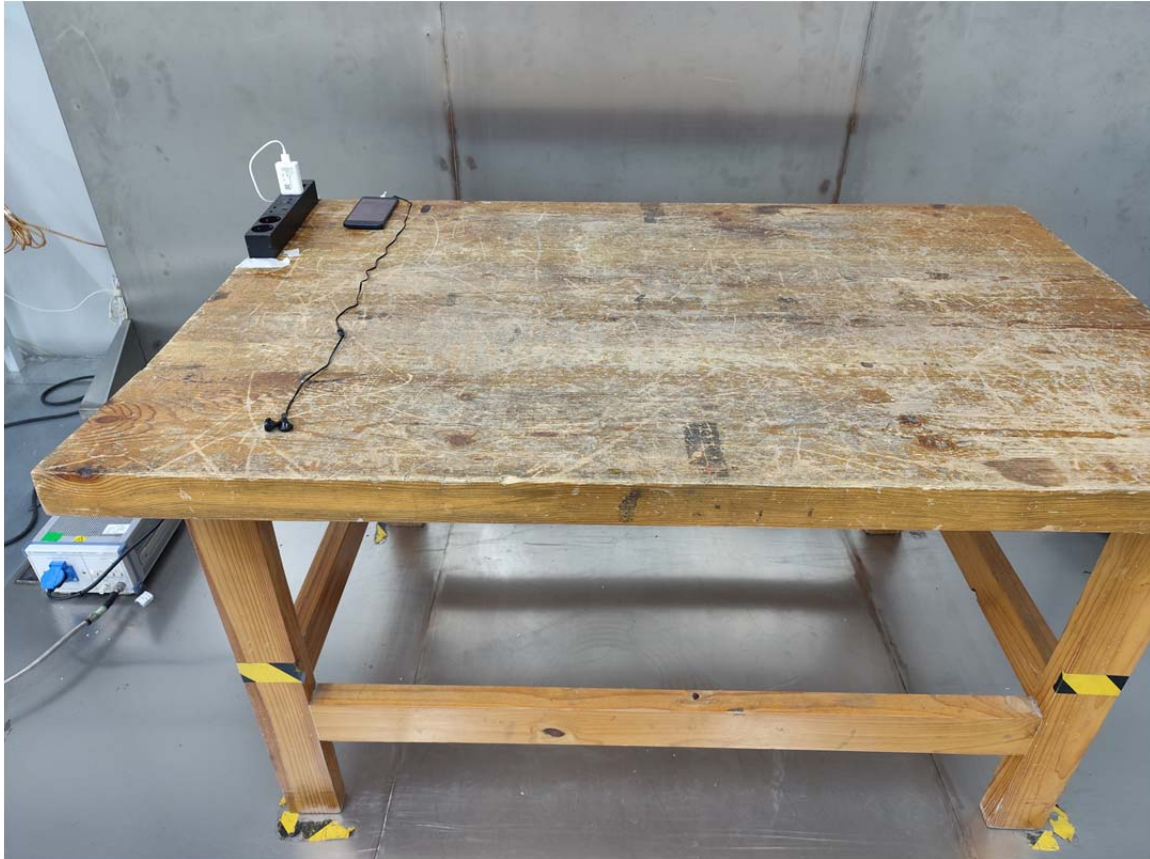
Conducted Emissions Side View Adapter #1