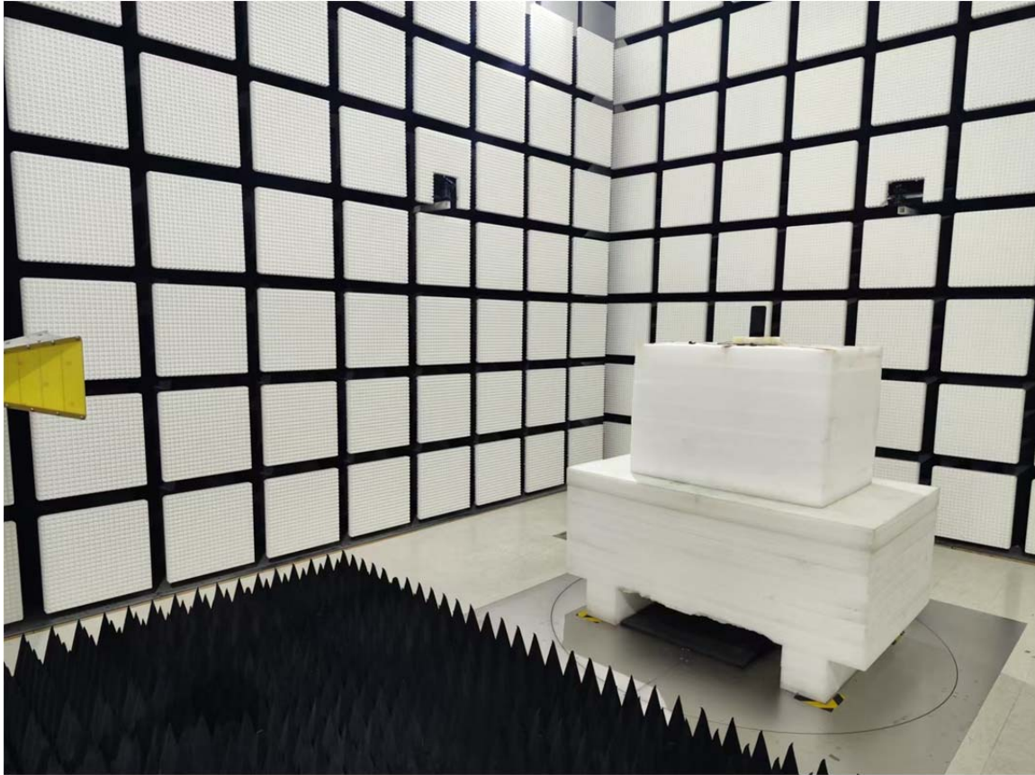
Radiated Emission 18-25GHz View Adapter #2