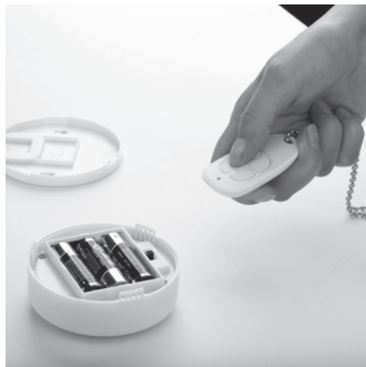
5.Press remote any key to pair with light(within 10 seconds)