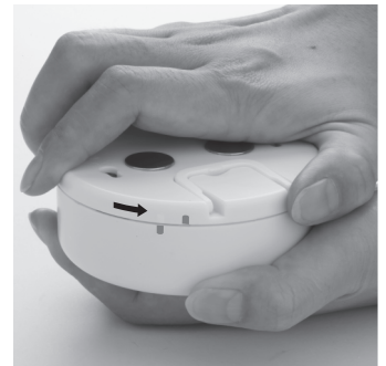
6.Close the cover