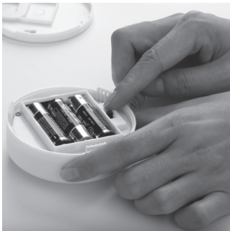
4.Switch to Auto(middle)