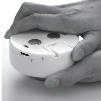
2.Open the batteries cover