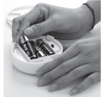
3.Put the batteries into the cell box