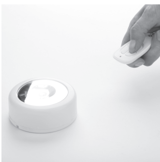
7.It is done.