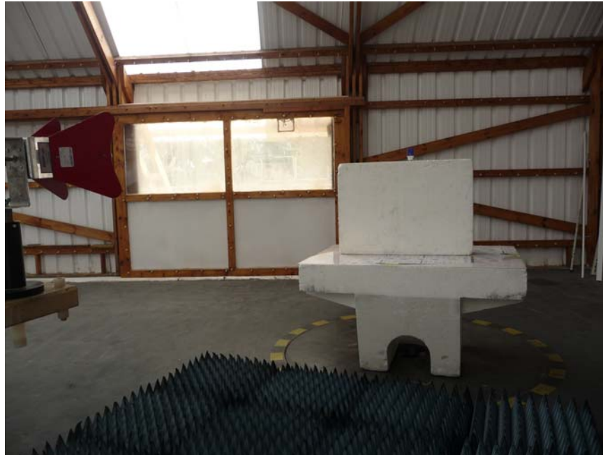
Photograph No.1 Carrier field strength measurement setup