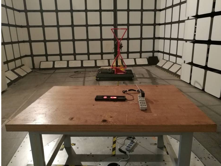
Radiated Emissions View (Above 1 GHz)