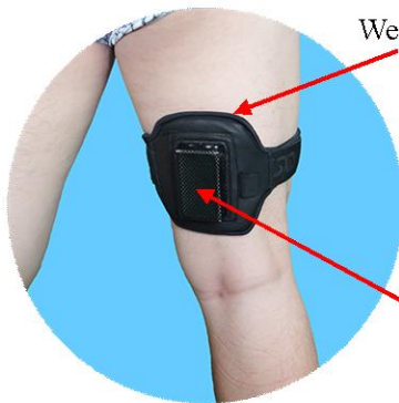
Wearing method and position