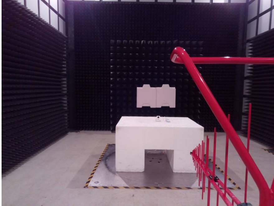
Radiated Emissions Tested View (Above 1GHz, Transmitting)