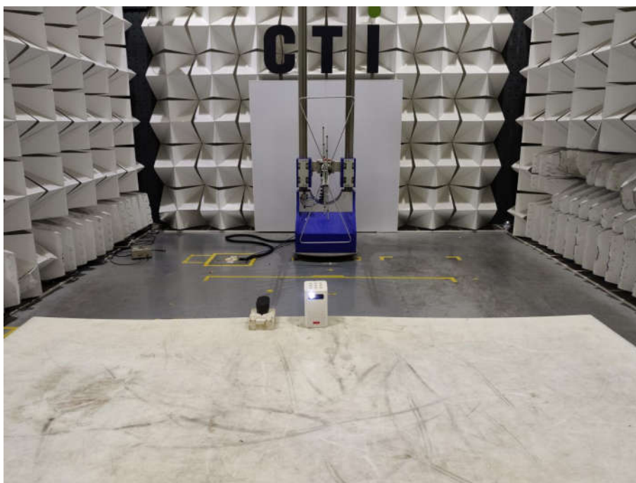
Radiated spurious emission Test Setup-2(Below 1GHz)