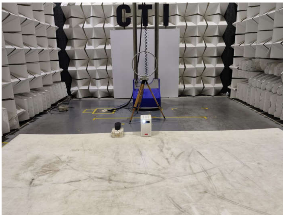
Radiated spurious emission Test Setup-1(Below 30MHz)