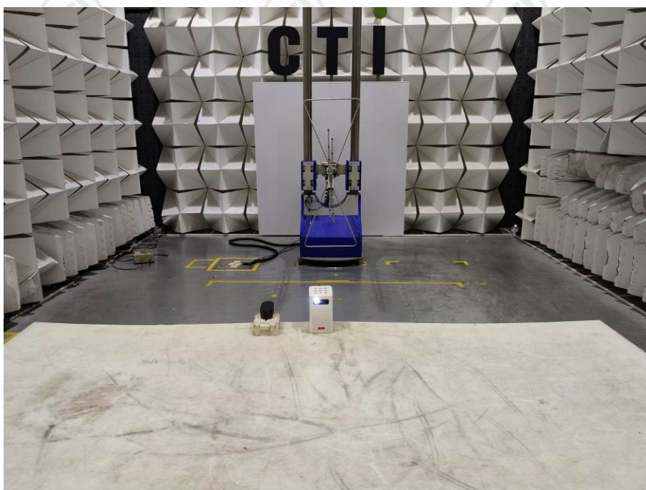
Radiated spurious emission Test Setup-2(Below 1GHz)