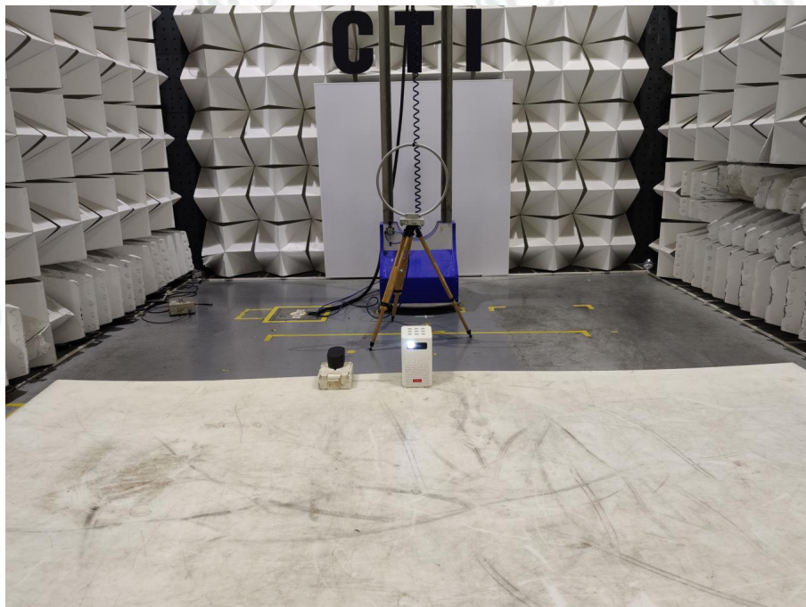
Radiated spurious emission Test Setup-1(Below 30MHz)