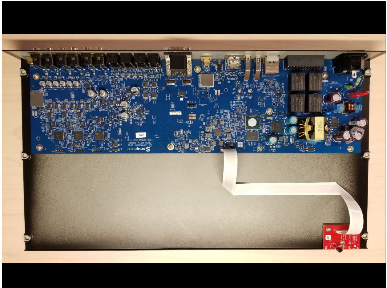
View of the TOP side of the PCB