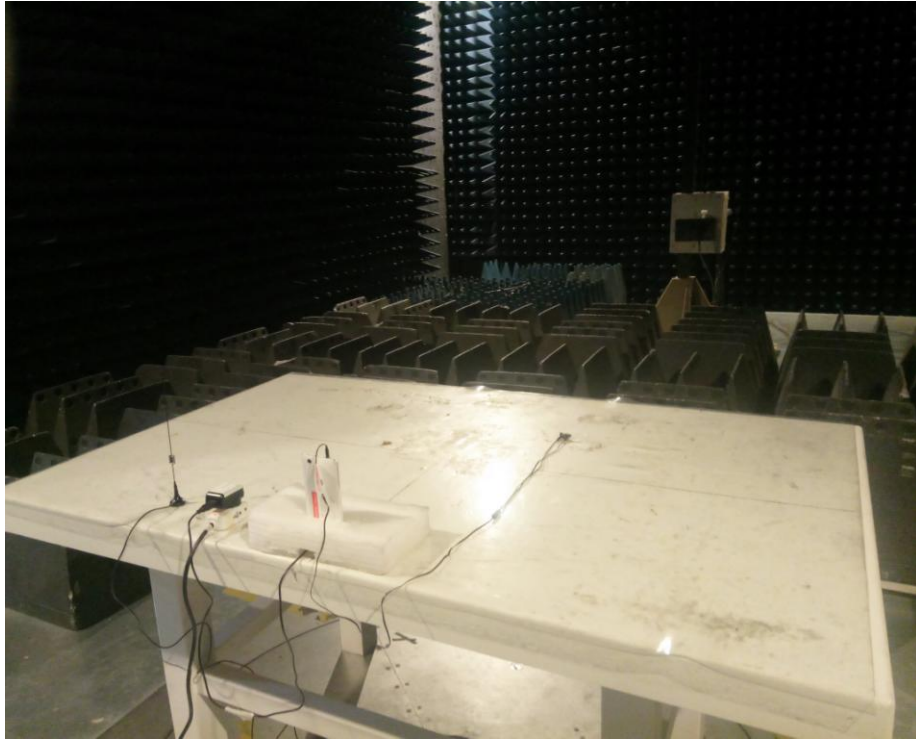
For Above 1GHz Test Site 1#