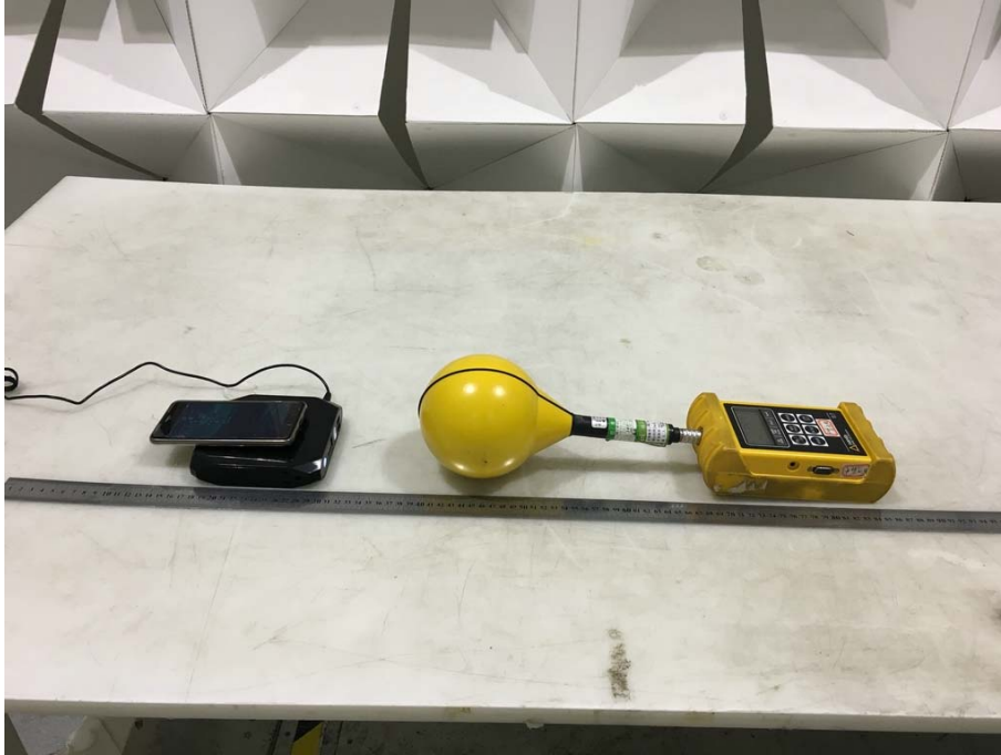
Charging Mode with load