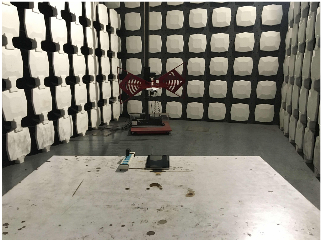
Radiated Emission Test