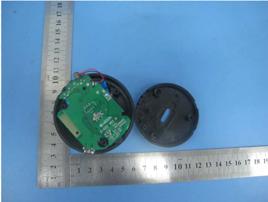
Photo 6 Appearance of PCB