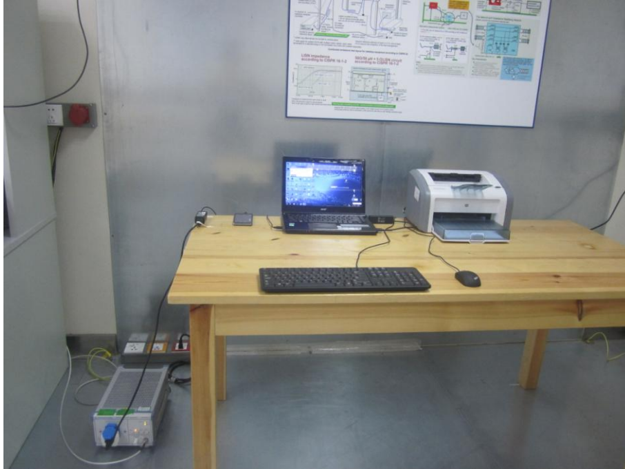
JBP radiation L