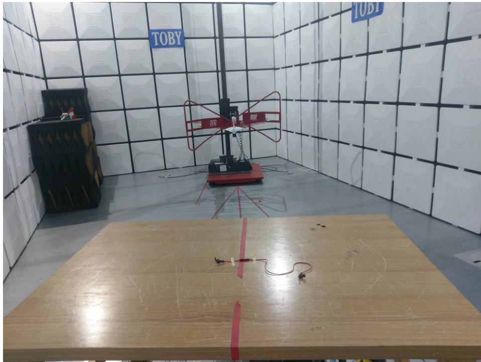
Radiated emission – above 1GHz