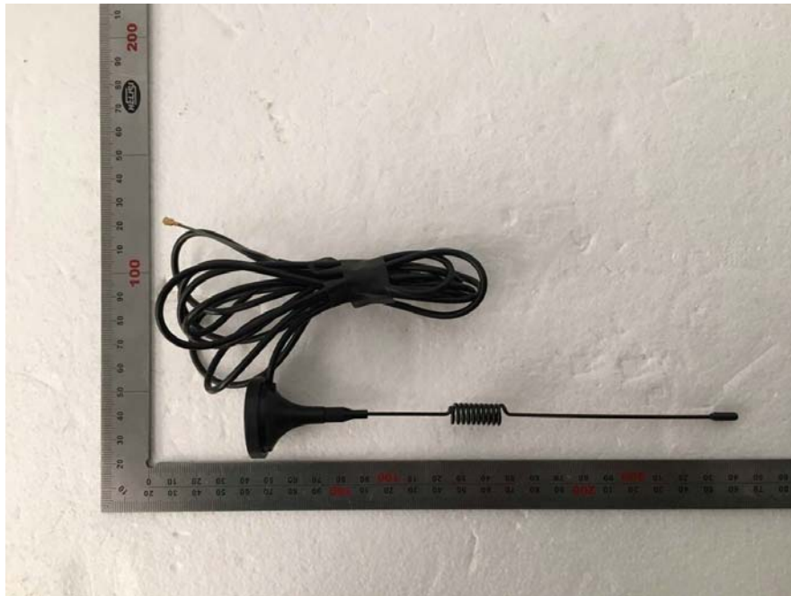
EUT-Antenna 2 View