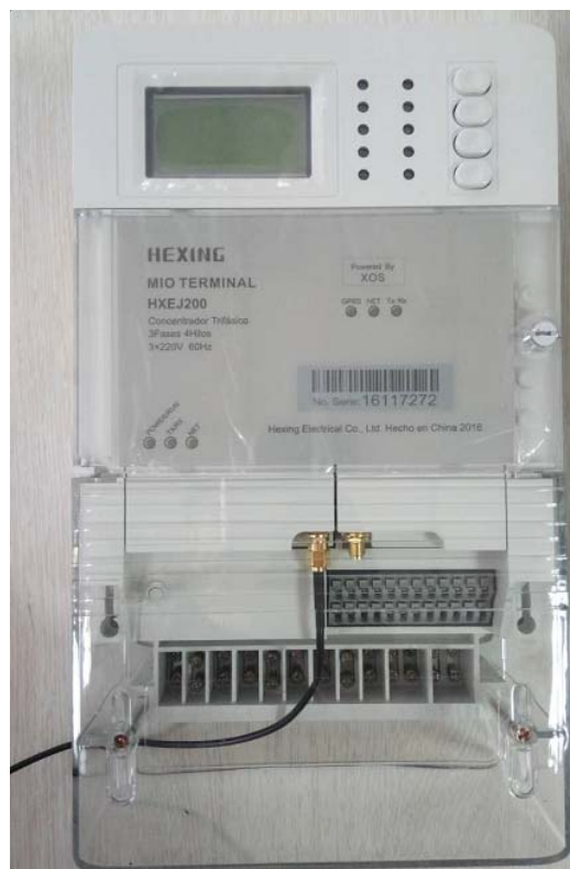
Installed in the sample