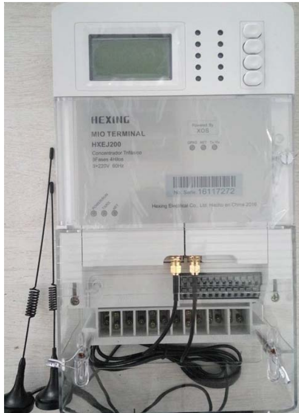
Installed in the sample