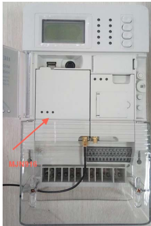
Installed in the sample