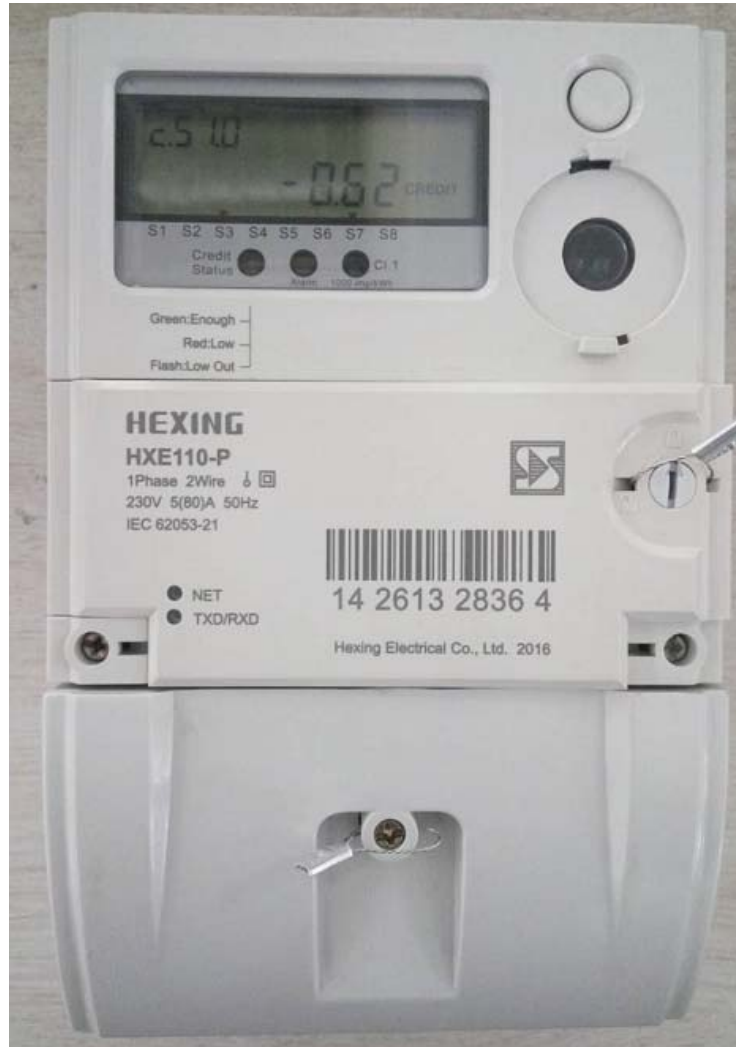
Installed in the sample

Electric meter models only for reference.