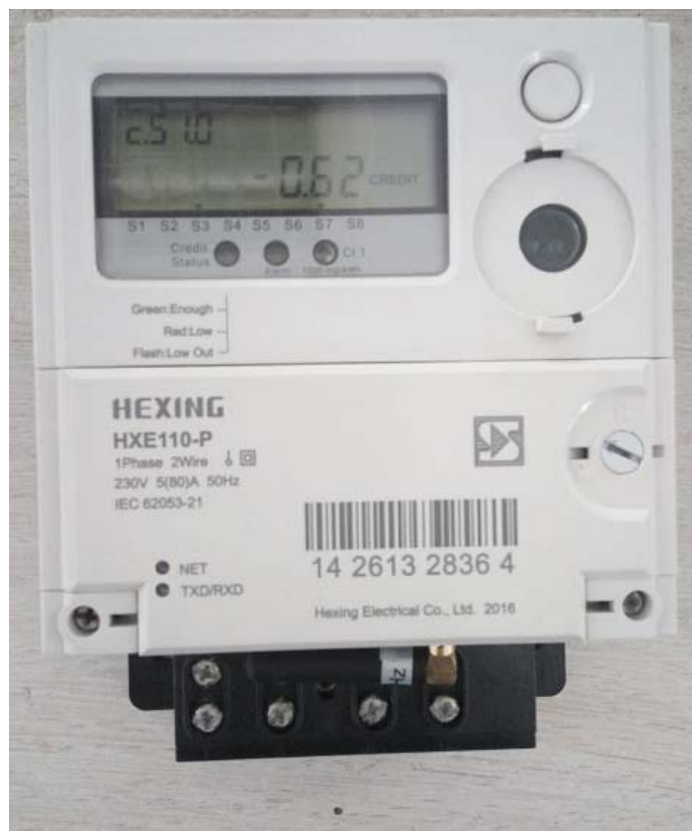
Installed in the sample