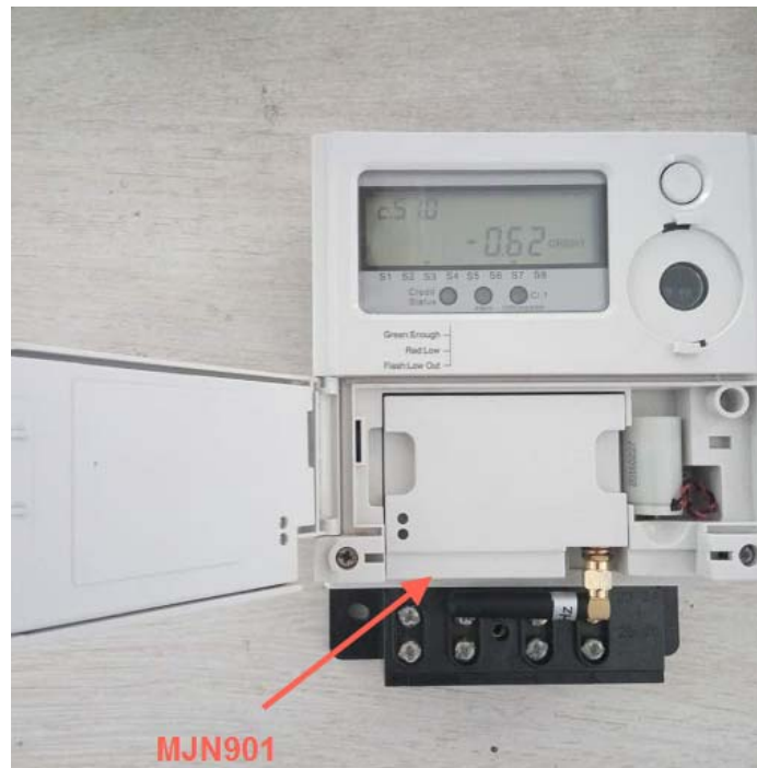
Installed in the sample